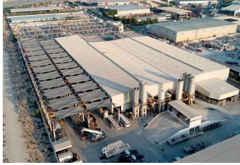
View of Hard Precast's company site in Dubai and the stored precast concrete parts.

The Progress Group is known for its high-quality products and customer satisfaction. They were able to plan the manufacture, delivery and installation of the required machines within a very short time. In addition to the mesh welding machine, an automatic stirrup bending machine from the EBA S line was commissioned. This robust and powerful machine is used for the manufacture of reinforcing steel stirrups in various shapes, which are used as spacers between wall and floor