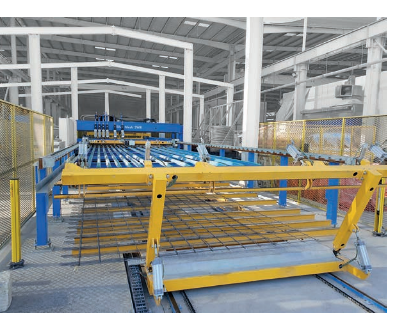
The newly developed system is designed for maximum flexibility in mesh production.

The new machine is convincing not only because of its high technological level, but also because of its economy in terms