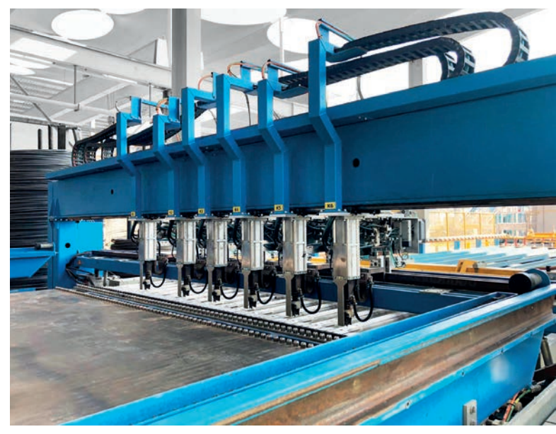
Reinforcement meshes are produced on the M-System BlueMesh® mesh welding machine with an exact fit and just-in-time.