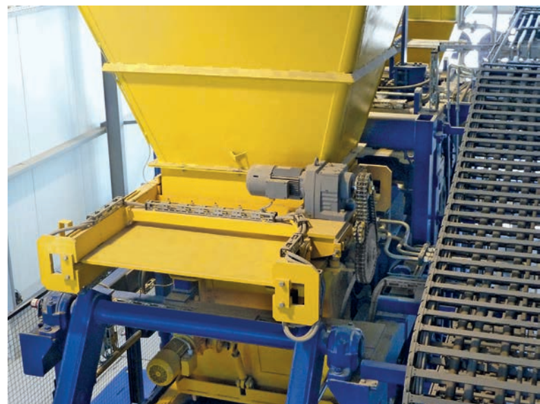
Electric version for the L-series block making machines