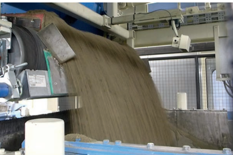
Filling box feeding via dosing belt.

By incorporating special equipment into the block making machine, the production of excellent multi-colored products can be cleared at an early stage. For example, the use of a dosing belt to feed the filling boxes instead of the standard dosing flap ensures a more even and controlled filling of the