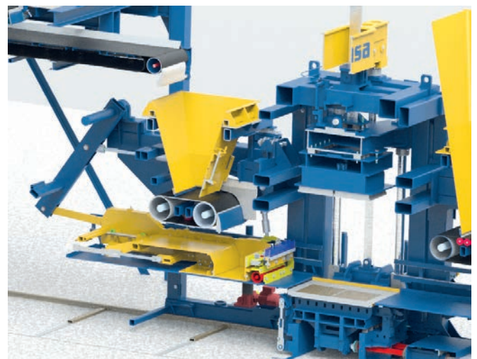
Face mix filling box with hydraulic bottom plate.