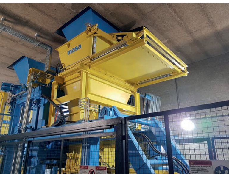
Hydraulic version for the block making machines of the XL series

The patented premium system accurately coordinates blends to enable the replication of highly varied color combinations repeatedly and assuredly. It can be used for blending the colors of both the main mix and face mix concrete. The system essentially consists of two assemblies: the silo unit with a swiveling dosing belt and the collection belt.