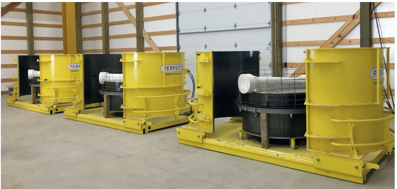
The casting moulds that have been prepared with EPS channels and steel reinforcement are ready to be filled with self-compacting concrete

Schlüsselbauer Technology developed the Perfect production system 15 years ago, and it has since established itself as the most frequently used technology for manufacturing individual monolithic concrete manhole bases in Europe and North America. The components produced using this