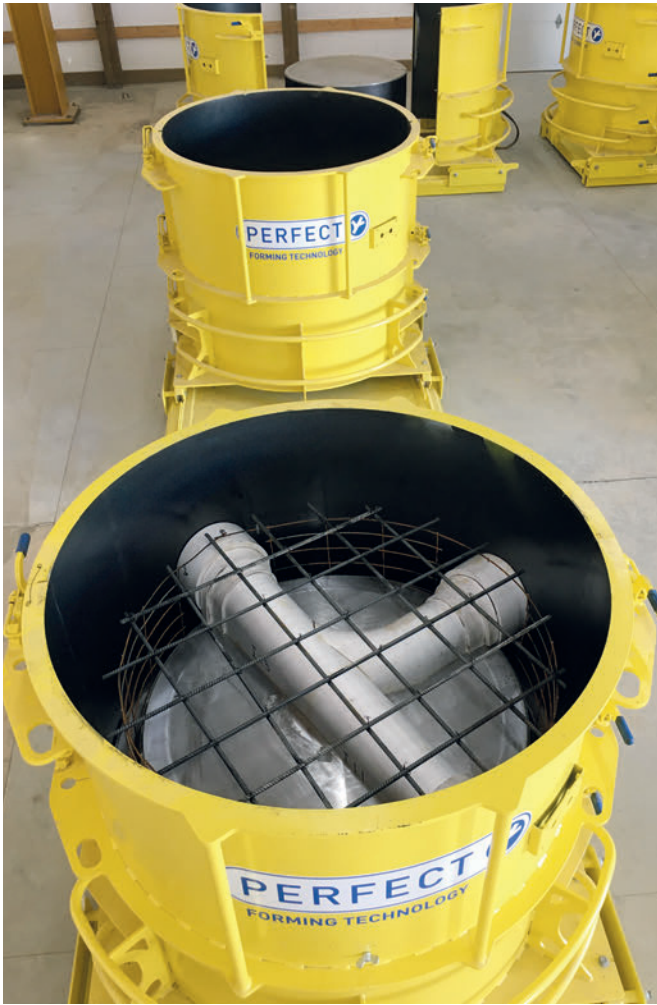
Perfect Forming Technology - this term refers to the casting moulds for high-quality concrete components that are constantly being optimized by Schlüsselbauer Technology

moved securely until they are placed in the trench, and they make it easier to accurately position the base and connect them to the concrete or plastic pipes. These are further aspects that were intensly worked out by Precast Supply and Schlüsselbauer Technology during the project planning stage and whose value Howard recognizes: "The Schlüsselbauer engineers are real perfectionists. They gave every single detail their full attention."