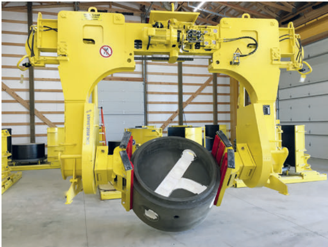
Precast Supply uses a hydraulic turning gripper to safely demould and turn the components