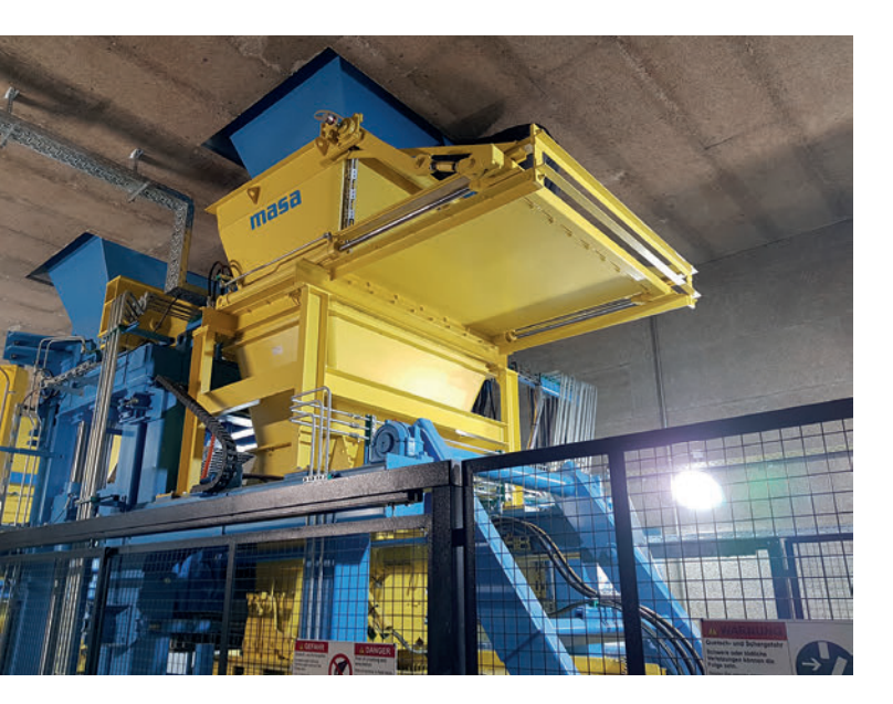
Hydraulic version for the block making machines of the XL series

The patented premium system accurately coordinates blends to enable the replication of highly varied color combinations repeatedly and assuredly. It can be used for blending the colors of both the main mix and face mix concrete. The system essentially consists of two assemblies: the silo unit with a swiveling dosing belt and the collection belt.