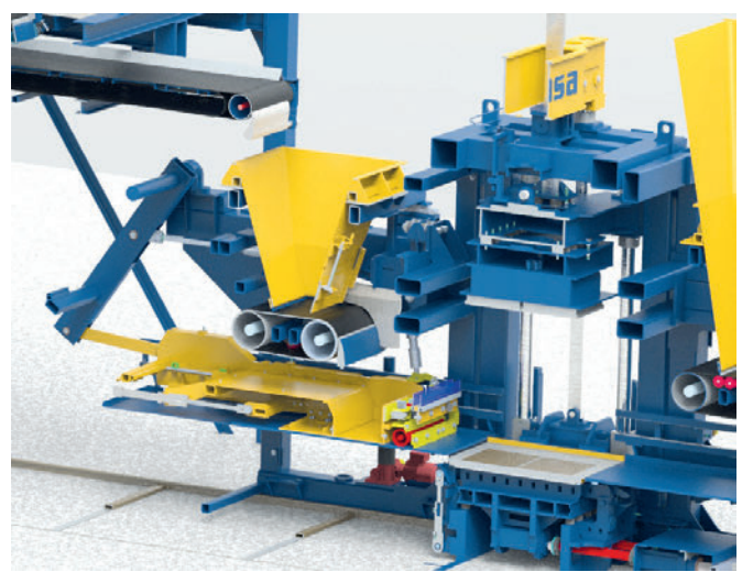
Face mix filling box with hydraulic bottom plate.