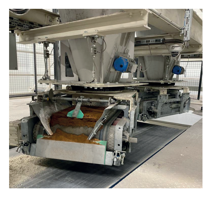
The patented Masa Multi-color system Premium