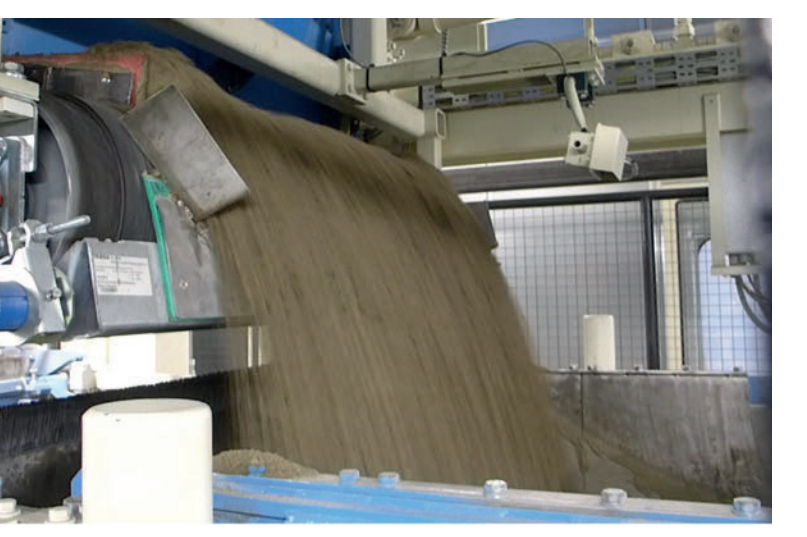
Filling box feeding via dosing belt.

By incorporating special equipment into the block making machine, the production of excellent multi-colored products can be cleared at an early stage. For example, the use of a dosing belt to feed the filling boxes instead of the standard dosing flap ensures a more even and controlled filling of the main mix or face mix filling boxes. Furthermore, the face mix filling box can be equipped with a driven bottom plate. This makes it possible to fill the mold only in the backwards move-