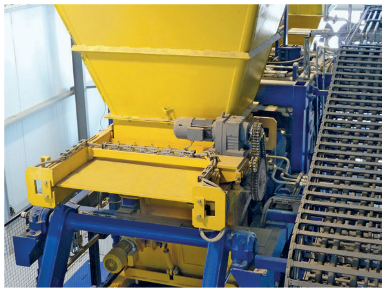
Electric version for the L-series block making machines