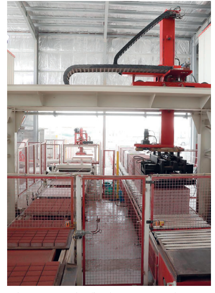
Cuber Servo 700 with walking beam conveyor and stone cube frame conveyor