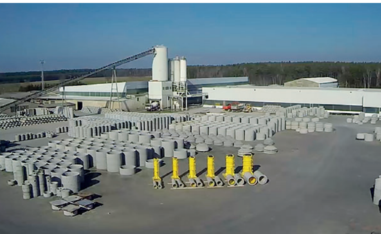
Presentation of the Perfect Pipe concrete-plastic composite pipe at Grafe Beton's factory site in Stölpchen, near the German city of Dresden.

Grafe Beton is a family company founded in 1903. It currently supplies customers far beyond the borders of the federal state of Saxony, where it is based, in countries such as the Czech Republic and Poland. Grafe Beton was awarded the Saxon State Prize for Quality and the title of "TOP Innovator 2011" in recognition of its continuous development and innovation, as reported in CPI 5/2012.