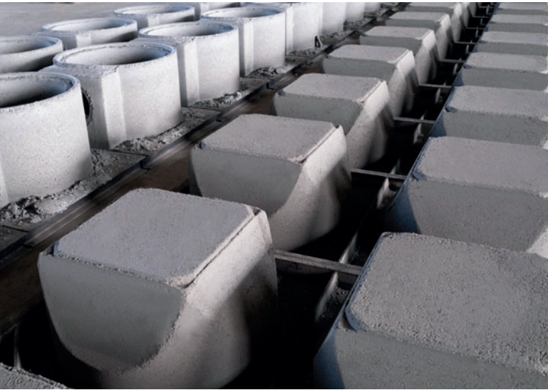
Products in the hardening area of Grafe Beton's production hall.

rapid and gentle, and enables the products to be set down in a space-saving way. If the drain parts are not equipped with installed parts that have to be continually fed into the machine by the worker, only a single worker is required for the entire production process, including the moving of the components to the hardening area. The production process in the machine takes place fully automatically and without any intervention by the operator.