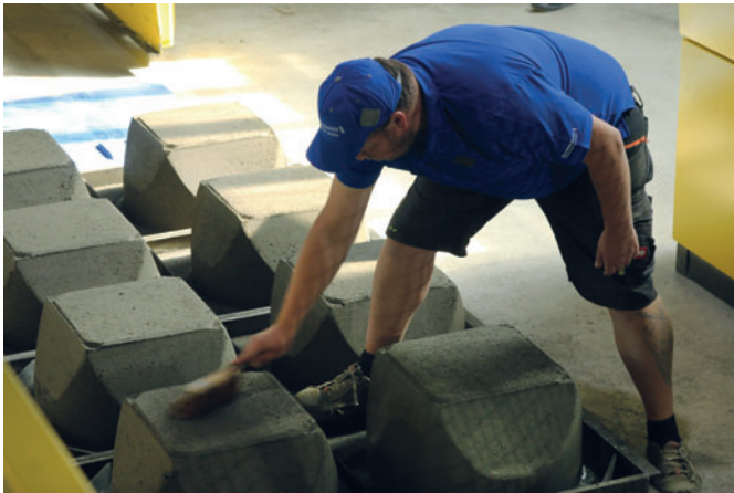
The manufacturing system is designed to be operated by a single worker.

reliable production method, even as it became increasingly important to boost capacity and, at the same time, modernize this production.