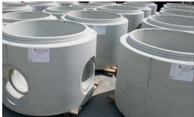
The Perfect concrete manhole bases are monolithic and produced in one pour - custom fabrication with the efficiency of an industrial manufacturing process.