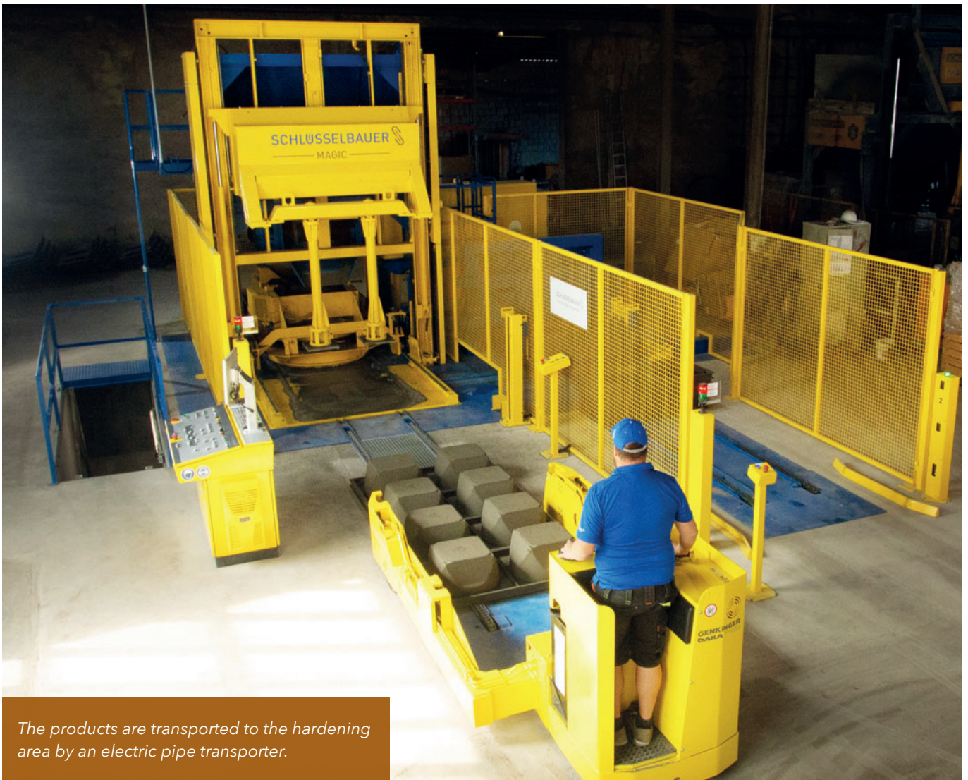
The products are transported to the hardening area by an electric pipe transporter.

At Grafe Beton, fresh products are transported from the Magic production system to the hardening area by an electric pipe transporter. This pipe transporter, which is also supplied by Schlüsselbauer Technology, enables maneuvering that is both