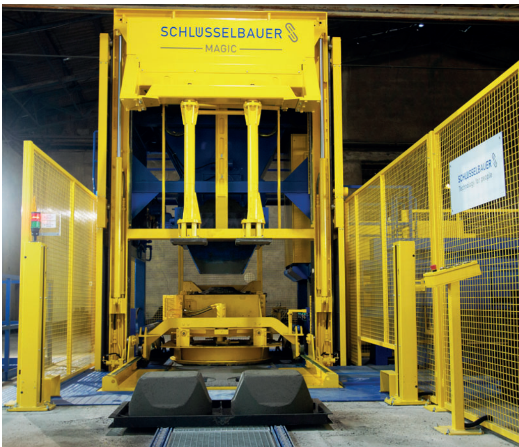
The Magic production system from Schlüsselbauer Technology produces road drain parts in double production.

Grafe Beton has been manufacturing street drain components to DIN 4052 for the different installation variants for many years. The range includes bases and intermediate rings with and without a drain, inter parts and support rings, and shafts and manhole cones. In Central Europe, the production of these various drain parts has been carried out by small concrete plants for many decades, mostly with the need for considerable manual labor. At Grafe Beton, the strategic decision was taken at an early stage to adopt largely automated production, even for these comparatively small concrete precast components. So it was that as early as the 1990s, the drain variants mentioned were manufactured on a Magic production machine from the Austrian system developer Schlüsselbauer Technology. Grafe Beton was reluctant to abandon this