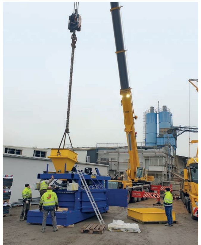
New equipment for Jasto

Jasto ensures consistently high-quality production facilities that meet a very high technical standard. Targeted expansions and modernizations of the plant in Ochtendung guarantees that Jasto stands up to all product areas with advanced technology on the market and manufactures with impressive dimensional accuracy and very high capacities. The Masa block making machine for the "Garden World" products, which came into operation in 2017, is running at full speed, as well as the Masa block making machine for wall building materials installed in 2014. In 2019, Jasto decided to modernize the facility. The aged concrete mixers should be supplemented by modern high-performance equipment that can easily and flexibly produce the entire range of required mixes.