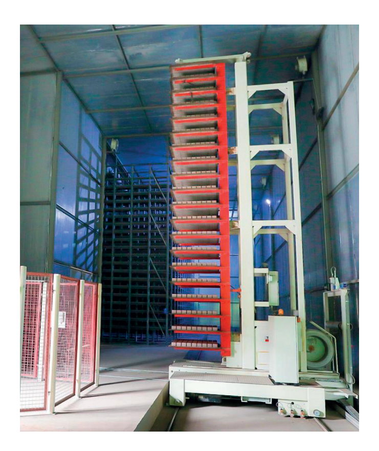
Finger car, 14to capacity

Efficiency is the biggest task for a concrete block making plant; therefore, customers are asking for short cycle times. But what counts at the end is the number of high-quality products, going out of the plant and a very limited wastage in production. Therefore, the wet and dry side of the plant have to be harmonized in terms of cycle time setup, depending on the different products produced on the wet and dry side. With a Hess concrete block machine a realistic wastage of less than 2 % is possible, through easy operating of the plant with the