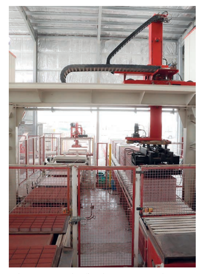
Cuber Servo 700 with walking beam conveyor and stone cube frame conveyor