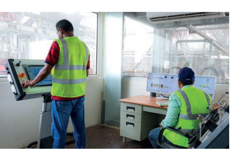
Karajan visualisation and control system

The customer chose a higher capacity coarse-mix mixer of 3750l due to a high demand of kerbstone production. The face mix mixer 750l was installed on the same mixing platform. The mixed concrete is transported to the block machine via double flying bucket. This prevents contamination of face and core concrete, beginning with the dosing of the grain sizes.