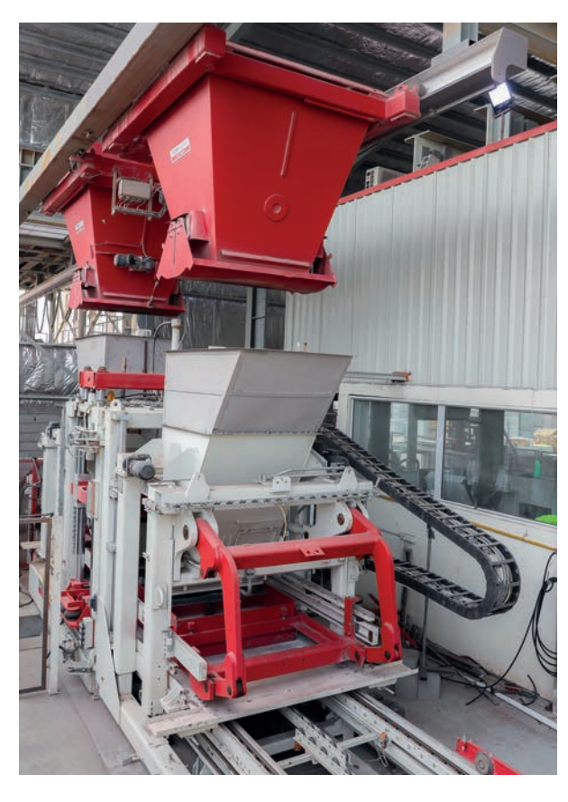
Block machine RH 1500-3 with double flying bucket

On the technical side, Hess Group provides machines which allow products from 25 mm to 500 mm, depending on the model chosen.