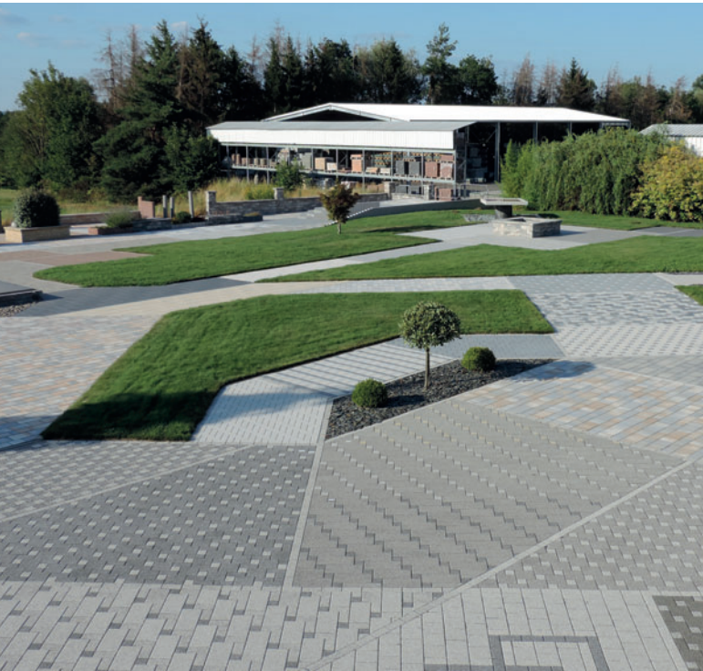
Heinrich & Bock stone garden