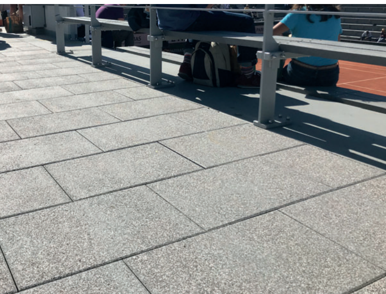
Detail view of concrete slabs

The tender for such a major project was demanding and tedious. Patrick Heinrich explains the special features and specific requirements: "The first step was to redesign the outside area of Court Suzanne Lenglen, on which natural stone had been laid before the modernisation. This was still the preference of the responsible architects. In comparison, however, concrete blocks offer the advantage that the identical recipe and thus a consistently high quality can always be guaranteed. Furthermore, we can provide our products with technical properties, for example, surface texture or optimum protection against displacement. From our point of view, therefore, concrete blocks were clearly preferable to other building materials from the outset. During the development phase, a natural stone from the complex served as a sample. Different stone heights of 8, 10, 12 and 14 cm were required, which we manufactured in a test production. After the first concrete