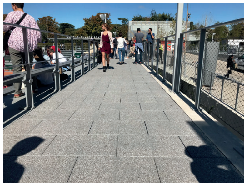
Laying in pedestrian areas