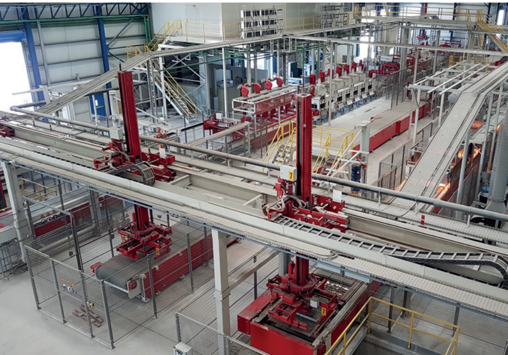
Figure 2: SR Schindler material handling system „Made in Germany“

As an outcome of several meetings in Germany and in the UAE the plant was developed with the Hess concrete mixing plant and the concrete block plant with the core machine RH 2000-3 MVA, which is individually tailored to the needs of Raknor, has all the capabilities to produce high-quality concrete block products.