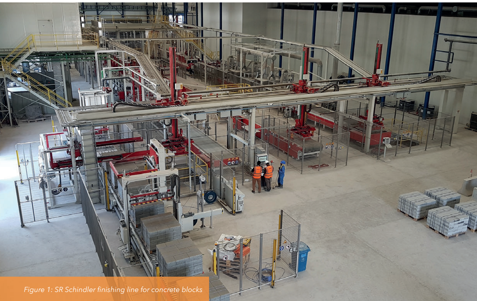
Figure 1: SR Schindler finishing line for concrete blocks

Subsequently, in collaboration with Raknor's specialists, Hess and SR Schindler developed and implemented an overall plant concept that best meets the ambitious expectations of all parties involved regarding productivity and achievable product quality.