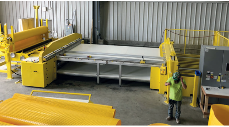
The fully automatic HDPE liner welding system from Schlüsselbauer Technology supplies liner cylinders from DN 300 to DN 1500 for a max. pipe length of 3 m.

the pipe and in the flexible pipe connections as well as the simple installation were important for the construction company. Details about this measure where GRP pipes DN 900 were replaced by the American Perfect Pipe can be found on the website of American Concrete Products Co. ( www.amconco.com/projects/1/2/utility-projects/smithville-mo-waste-water-treatment-facility/ ).