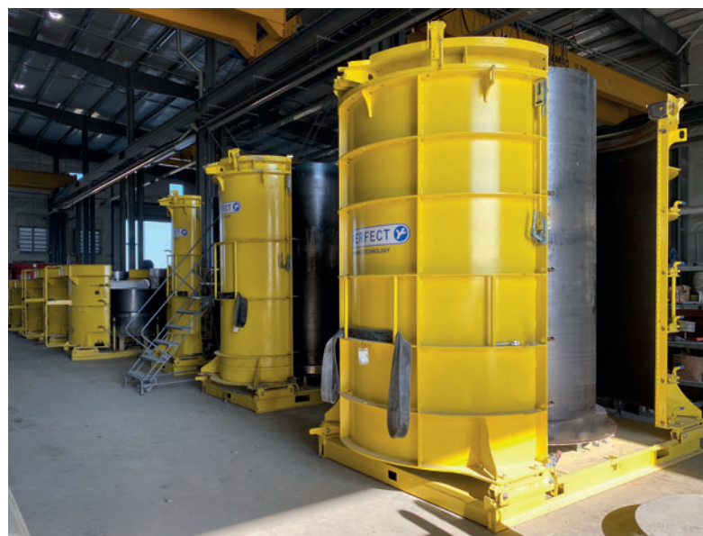
The Perfect Forming Technology moulding system for processing self-compacting concrete is a key element of the Perfect Pipe production process.

Corrosion protection must be identifiable and easy to measure even after decades of use. The protection system must naturally have a reliable, strong connection to the concrete pipe. Last but not least, the protection system must also be economically beneficial. All these requirements are met through the minimum wall thickness of the Perfect Liner of