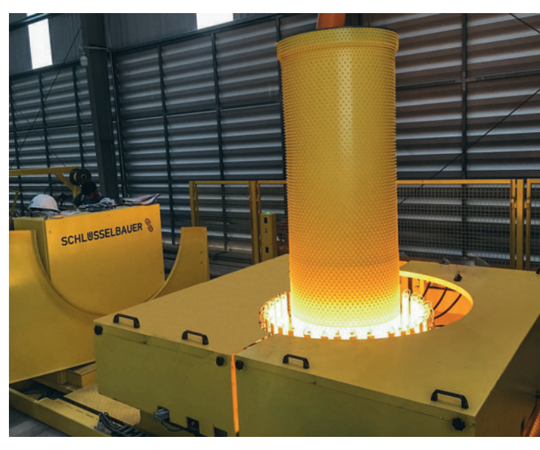
The thermoplastic forming of the liner cylinders is an essential step in the production of Perfect Pipe