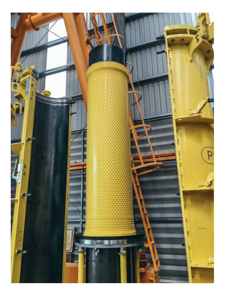
The Perfect Liner is placed on the expandable core