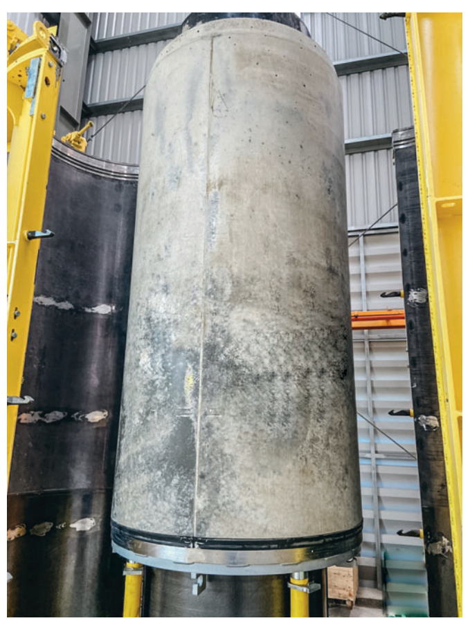
Perfect Jacking Pipe-cured after a few hours in the casting mould

The corrosion protection material HDPE, which is used by Phnom Penh Precast Plants in the jacking pipes, has a thickness of 1.65 mm and several fundamental properties for protecting the concrete pipes. The extraction force of the Perfect Liners with optimized thickness is 0.9 N/mm², making them one of the strongest anchored material for concrete corrosion