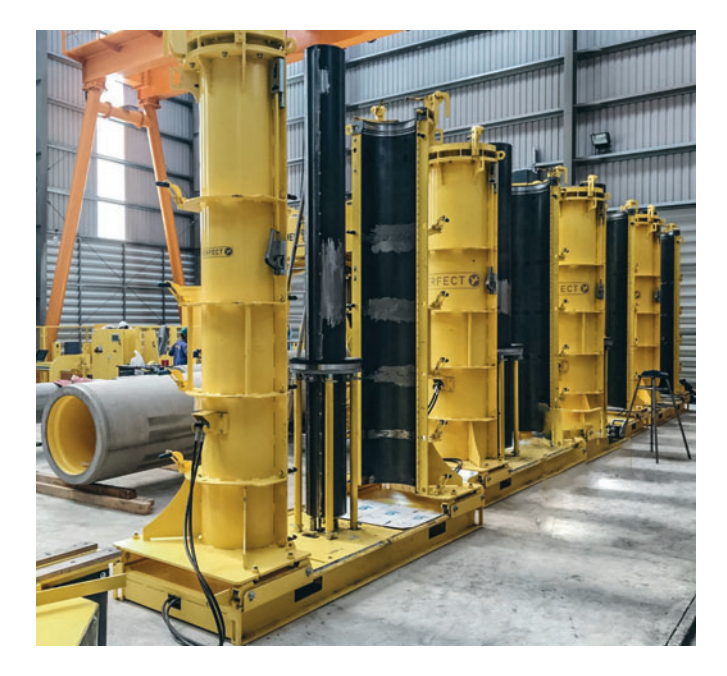
User-friendly molds of the category Perfect Forming Technology from Schlüsselbauer in production at Phnom Penh Precast Plants, Cambodia

The relevant dimensions of the robust pipes needed for the current civil engineering market in Cambodia for trenchless installation/microtunneling range from DN300 to DN700. According to the project requirements, the pipes can be produced with overall lengths of 2 m or 3 m. In each case the required length of the HDPE liner is first cut of a coil, rolled and welded into a cylinder. To create a flexible joint in the finished pipe, both ends of the cylinder are expanded in a thermoplastic process. The resulting recess, formed at both ends of the cylinder is exactly dimensioned for insertion of the plastic connector, which reliably seals the pipe against leakage and water ingress with two external gaskets. This technology eliminates the need to weld the pipes on the construction site as