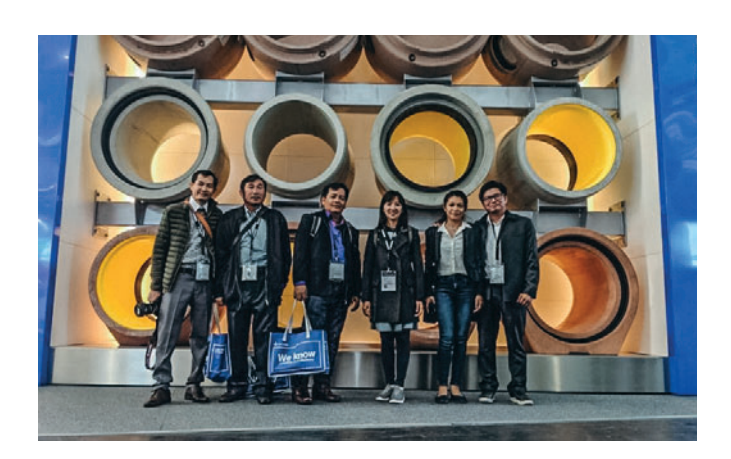
The delegation from Phnom Penh Precast at bauma 2019

"Go for the Best" and "The strength to drive it through" are key elements of Phnom Penh Precast Plants' innovation strategy. On one hand, going for the best demands the requisite expertise in the company's respective service areas. On the other hand, it also requires the will and determination to convince partners in the civil engineering value chain of the benefits of innovation and to leave behind traditional, outmoded practices. The innovation that can be seen at Phnom Penh Precast Plant combines both elements. And Phnom Penh Precast Plants' entrepreneur role in its home country manifests itself in multiple ways, including recognition by local media or through its membership in international associations.