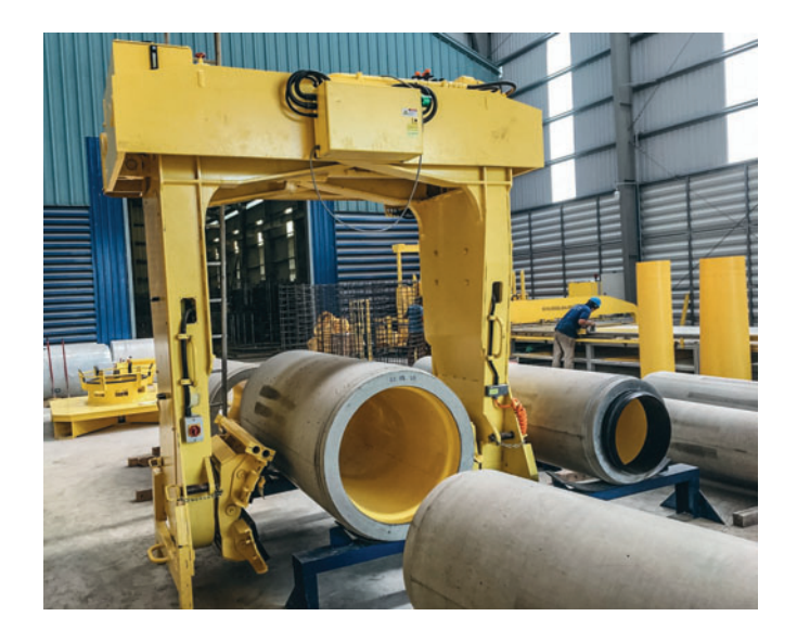
Phnom Penh Precast Plants is currently using the Perfect Pipe technology in the inaccessible diameter range up to DN 700