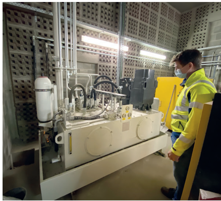
Fig. 5: Press hydraulics