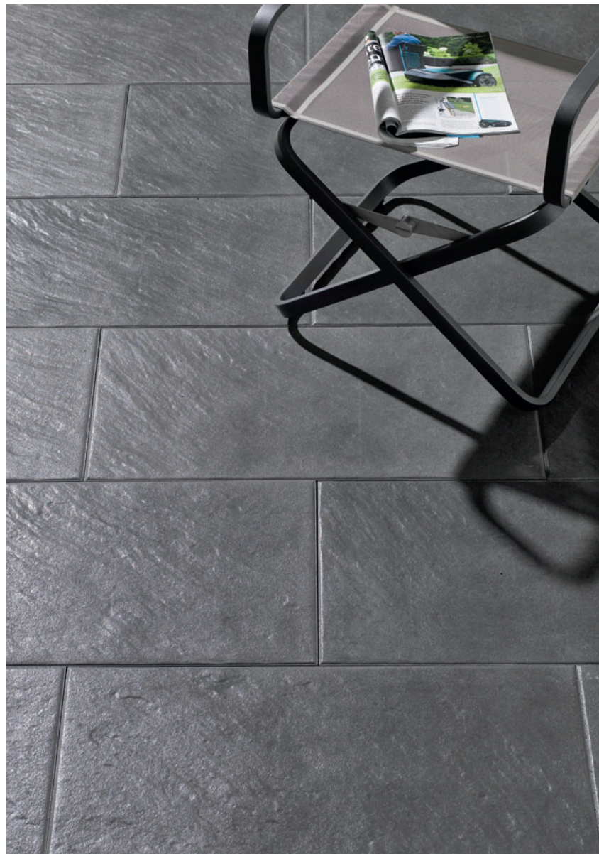
Fig. 1: Refined premium concrete slabs

One of the specialities of F.C. Nüdling Betonelemente GmbH + Co KG are refined premium concrete slabs with very high-quality standards (Fig. 1).