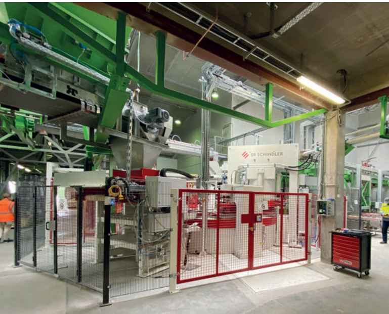
Fig. 2: General view of the press