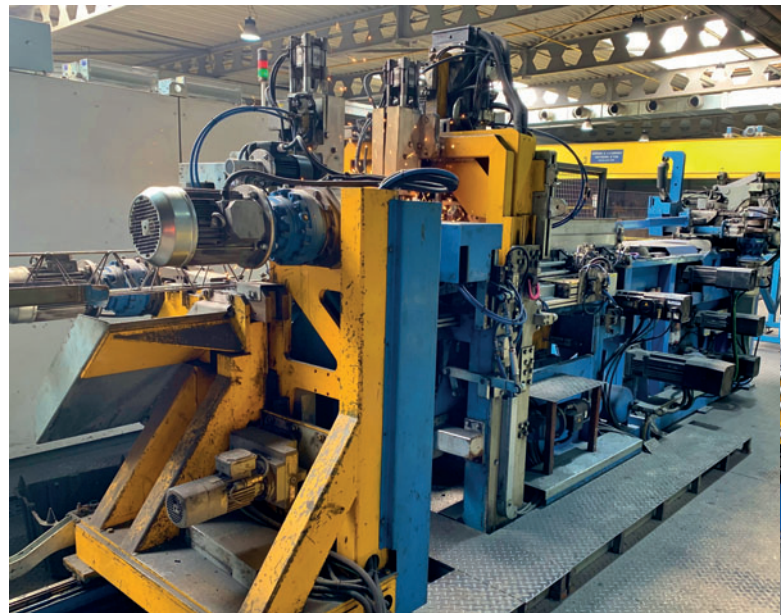
The VGA Versa lattice girder welding machine produces just-in-time lattice girders in different heights for the carousel plant and is equipped with an automatic top wire diameter change.

Orion Beton found the right partner for these high demands in the Progress Group. Reliability, experience as well as familiarity with the performance have been the decisive factors for this long-standing successful cooperation. ■