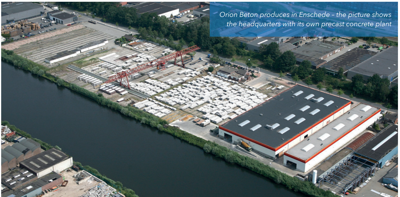
Orion Beton produces in Enschede - the picture shows the headquarters with its own precast concrete plant

"The decision in favour of e fbos and thus in favour of Progress was made, among other things, because of the open structure of the database and the structural updates. The possibility of integrating ebos into e fbos played an important role, as did the fact that we have been familiar with the pleasant cooperation with Progress for almost 20 years," emphasises Jan Rook.