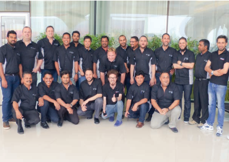
The previous participants of the Hess Group Training Academy were very satisfied.