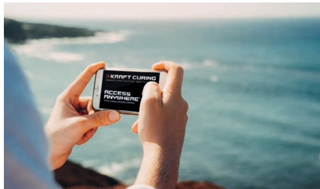
Access Anywhere provides instant mobile access to operators of concrete curing systems from virtually anywhere with internet access.

Access Anywhere is as robust as the internet and provides access when it is needed around the world.