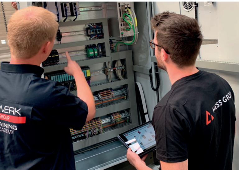
Introduction to the functionality of the control cabinet

technology. In addition, a comprehensive occupational safety training course is also part of this, which is specifically related to the machine manufacturer's components. The Training Academy courses take place either in the Hess Group's training rooms or, if desired, directly at the customer's premises.