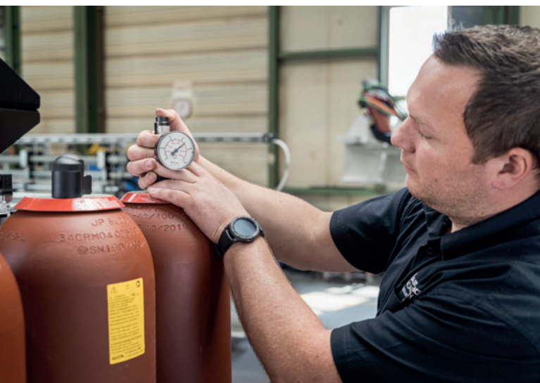
Testing of the bladder accumulator for constant performance and safe operation

In most cases, the systematic improvement of employees' skills starts with basic training. It is also suitable for employees with medium to low basic knowledge and conveys the most important focal points of the various specialist areas: The basic program includes the structural design of a concrete machine or plant, an introduction to operating modes, machine functions and settings as well as basics of concrete