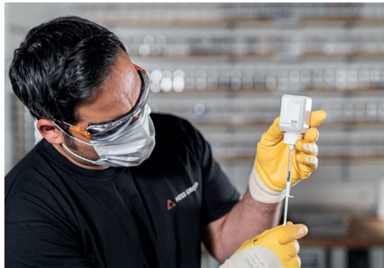
Investigation of the chemical properties of aggregates

In the intensive course on the subject of control, the Hess AR glasses are presented, among other things. These smart