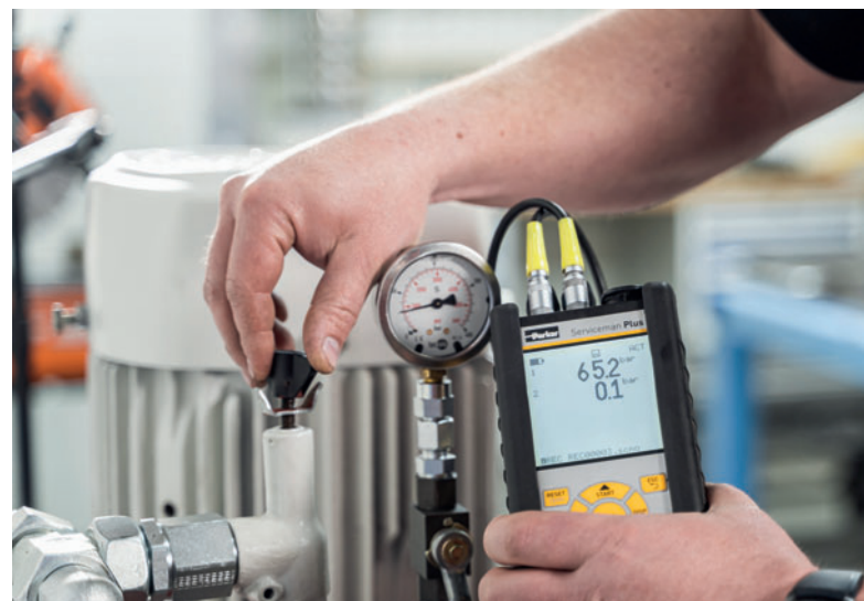
Checking the system pressure