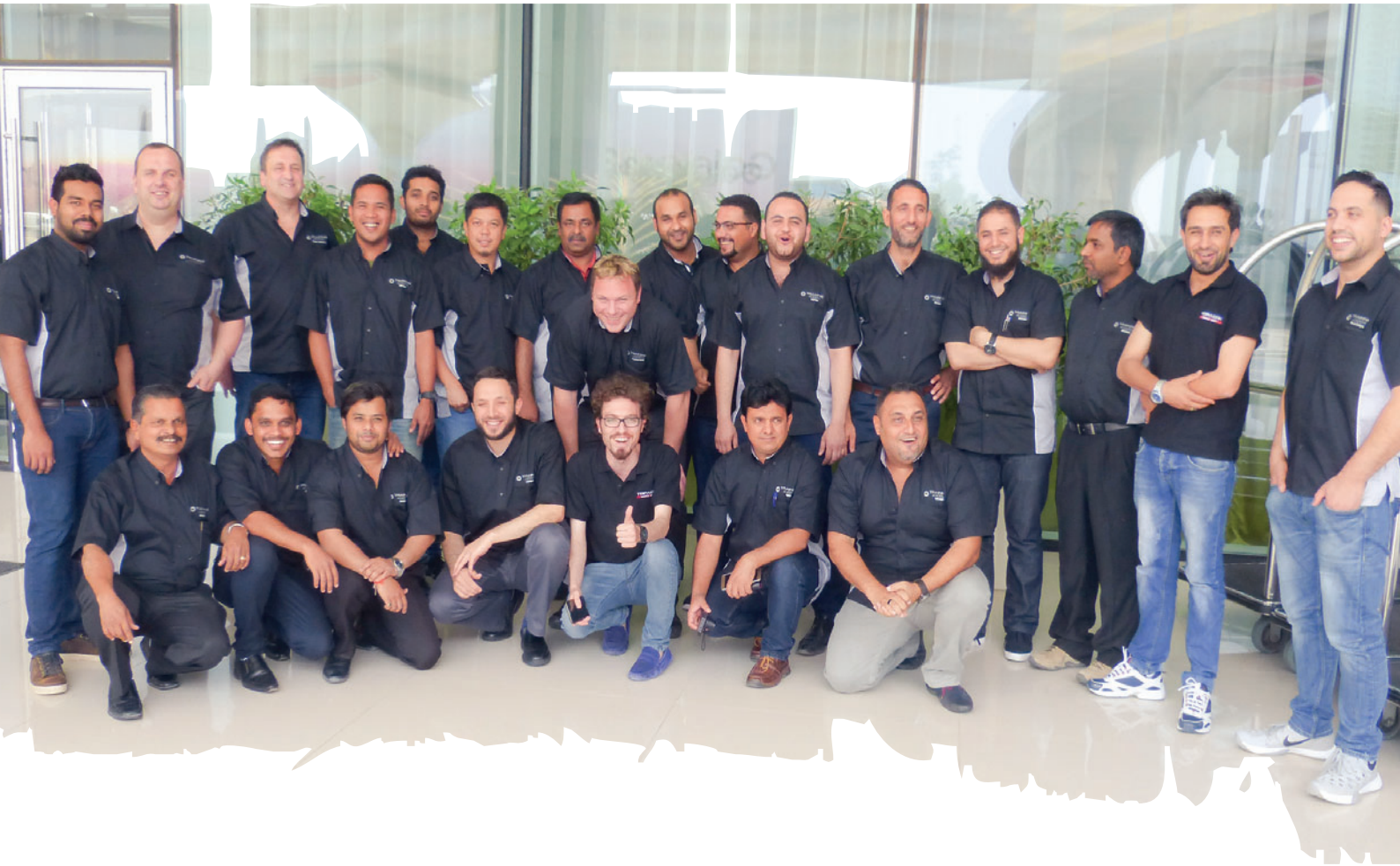
The previous participants of the Hess Group Training Academy were very satisfied.