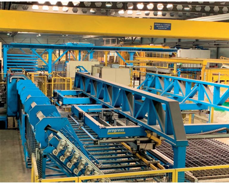
The M-System mesh welding plant was developed for the most flexible production possible and thus fits very well into the overall concept.

forced steel from the EBA S-line. All these machines come from Progress Maschinen & Automation, also a company of the Progress Group company.