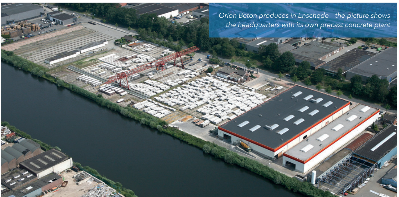
Orion Beton produces in Enschede - the picture shows the headquarters with its own precast concrete plant

"The decision in favour of e fbos and thus in favour of Progress was made, among other things, because of the open structure of the database and the structural updates. The possibility of integrating ebos into e fbos played an important role, as did the fact that we have been familiar with the pleasant cooperation with Progress for almost 20 years," emphasises Jan Rook.