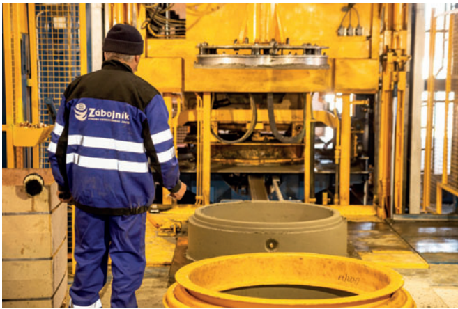
Manhole risers are normally produced in two different wall thicknesses, each available in three construction heights.