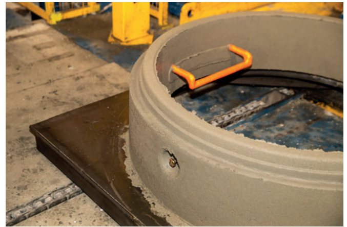
In addition to lifting anchors, step rungs are also automatically transferred to the machine independently from the cycle time and compacted into the component using vibration.

tion throughout the entire production cycle. However, for Zábojník s.r.o., product quality does not just mean producing the precast component with constant concrete compaction and surface finish. The quality of all installations, such as step rungs or the Czech Republic's typically used step boxes, are also decisive for the acceptance of the components in the market. In addition to climbing aids, Zábojník s.r.o., was also giving themselves another challenge—from now on, transport anchors would also be reliably installed in almost all products and with minimum work.