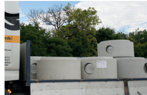
At the second company site, Perfect concrete manhole bases are produced with tailor-made channels and, in most cases, integrated gaskets.