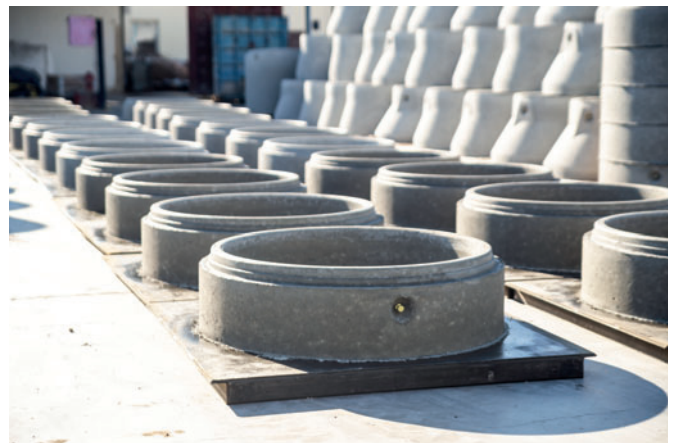
Ball head anchors, securely compacted into the concrete using vibration, provide the basis for safe handling through to its installation on the construction site.