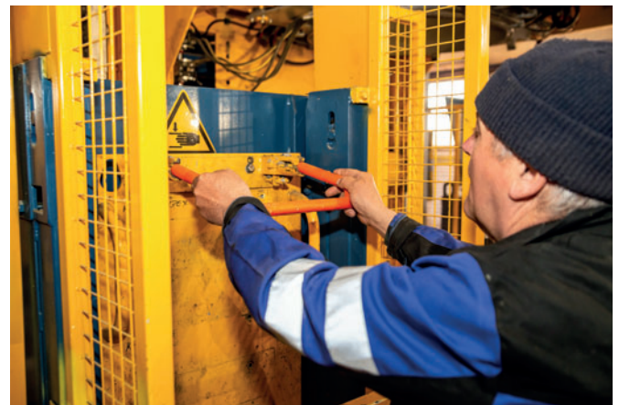
The machine operator sets-up the step rungs that are needed in each case for automatic transfer to the machine.