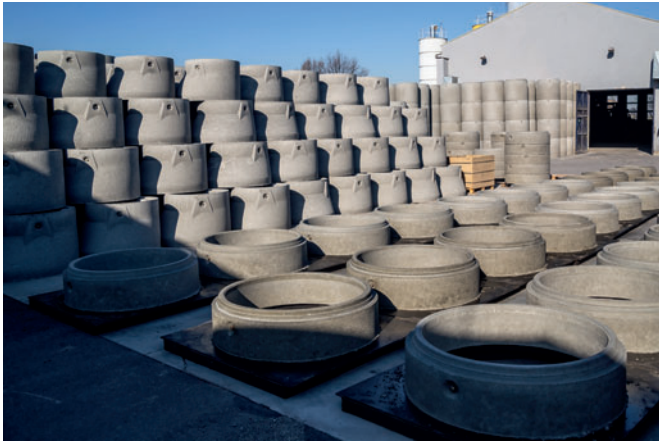
Warehouse overall view