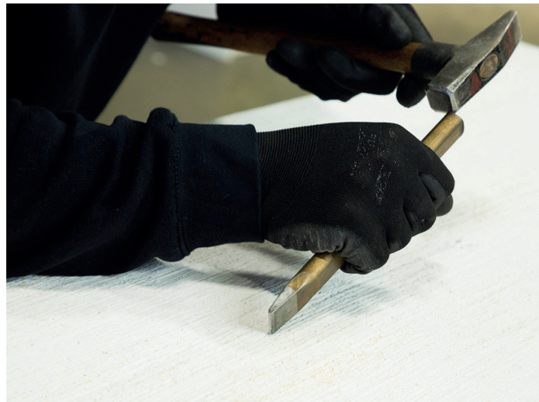
Fig. 3: Preparation of a design draft

With these properties, we help our customers to produce concrete slabs that meet the highest demands in terms of appearance and suitability for everyday use," reports Andreas Schlemmer, who worked for more than 25 years in a well-