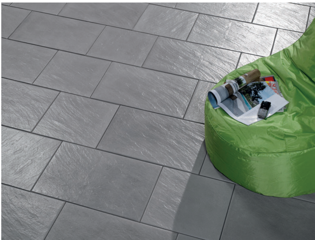
Fig. 1: Sophisticatedly designed concrete products suitable for everyday use are enjoying steadily growing demand.

"The outstanding feature of all SR Schindler rubber matrices is their very high dimensional accuracy and long service life.