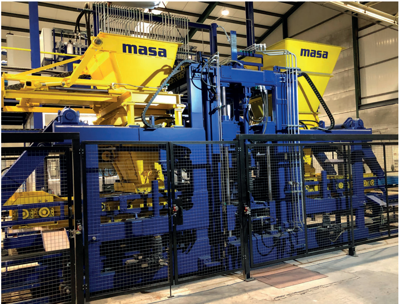
Masa block making machine L 9.1 for the production of concrete blocks with or without face mix layer