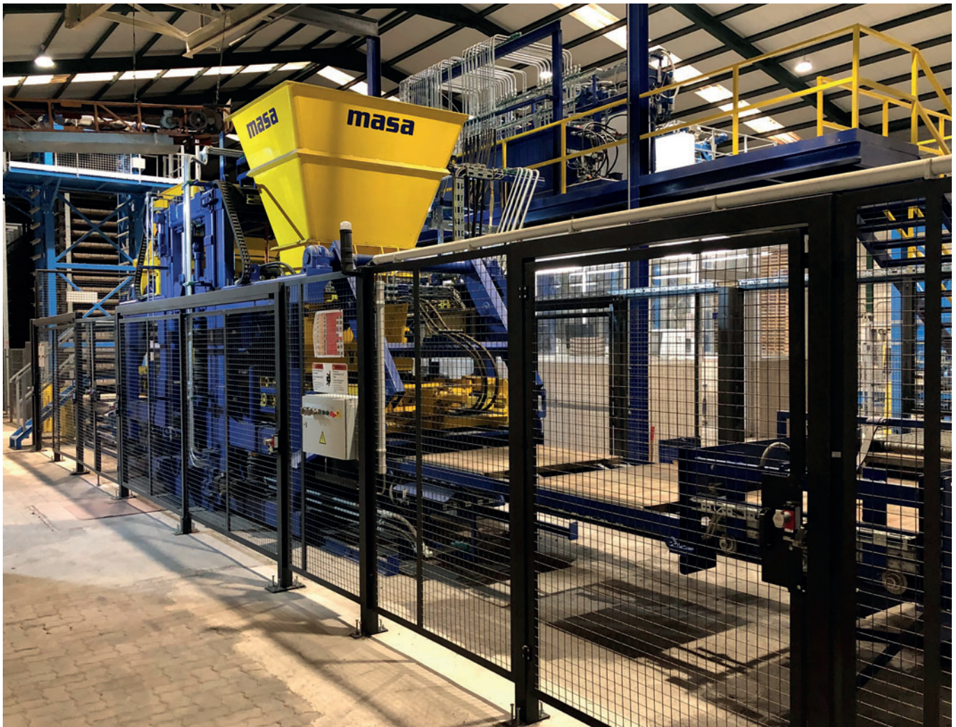
The new Masa L 9.1 is the heart of the plant.

plant downtime when the Masa machine was connected to the existing dosing and mixing plant. The new L 9.1 was installed in a second hall, while production continued with the old multi-layer paver machine in the existing production hall. After the Masa machine was installed, the existing dosing and mixing plant was relocated and connected to the new machine in just two weeks. Commissioning and test runs went smoothly, and the interfaces to the other components of the production system were implemented without any problems. De La Jara now produces a range of paving stones on a reliable and efficient Masa machine that leaves nothing to be desired. Alfredo Cebrian and the entire De La Jara team are convinced that the new system was the best investment in their future. ■