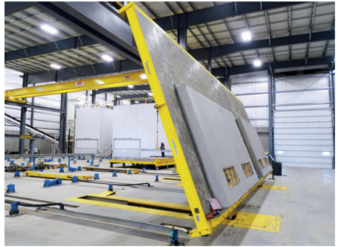
With the aid of the tilting device, the wall elements are tilted and can be conveniently removed in the later installation position.

Huffcutt uses the solid walls produced on the new German-made circulation plant primarily for the construction of sanitary houses especially for motorways. These are designed in an architecturally sophisticated way and individually accord-