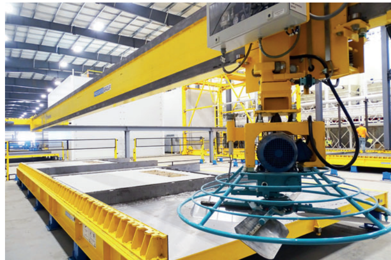
A power trowel is used for fine smoothing, resulting in a very finely smoothed, paintable concrete surface that does not require any subsequent post-processing.