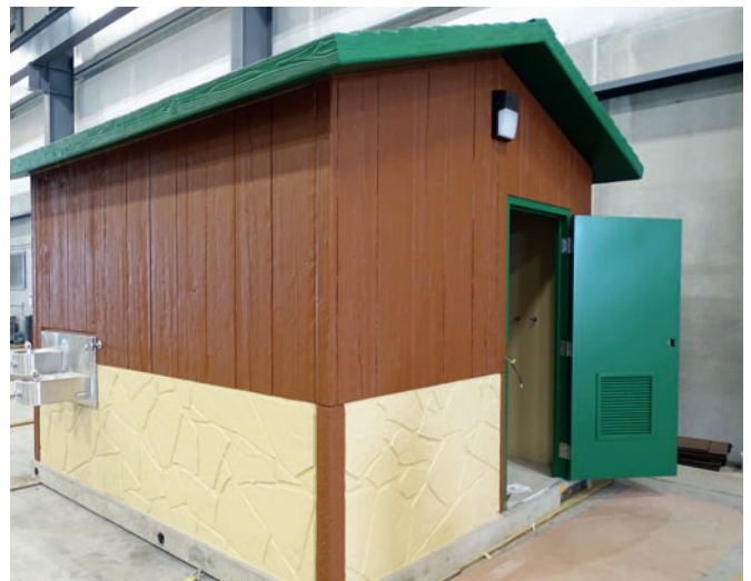
Huffcutt manufactures sanitary houses from solid concrete elements and assembles them directly in the plant, already completed with all sanitary facilities. The small buildings are designed in architectural designs with coloured concrete and form liners in tile, stone and wood optics.