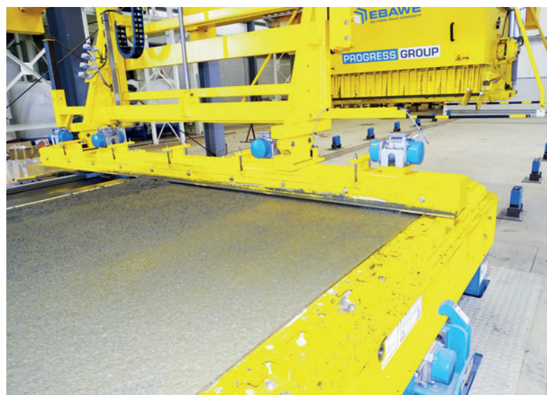
The levelling beam attached to the concrete spreader draws off the concrete and compacts it according to the depth of the concrete layer.