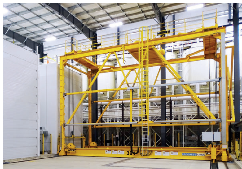
The pallet stacker serves the two racks and stores and retrieves the pallets with the freshly concreted solid wall elements.

After completion of the production cycle, the removed solid wall shuttering is cleaned by means of a set down-cleaning device. The pallet passes through a stationary cleaning unit and is given a clean pallet surface by means of spatula and brushes and is thus ready for the next production run.