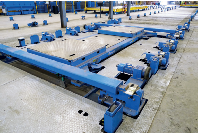
The combined compaction equipment moves the pallet vertically and horizontally, giving the customer maximum flexibility in the final product.