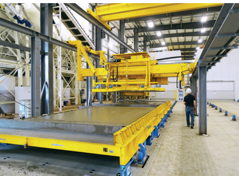
Huffcutt Concrete Inc. manufactures solid wall elements in the new plant and can offer them with an extremely short delivery time.

Last year, Huffcutt invested around 26 million euros in the construction of a completely new production hall at the Chippewa Falls site. The solid walls produced on stationary tables were to be produced quickly, efficiently and with high quality on a circulation plant in the future. Huffcutt chose the German company Ebawe Anlagentechnik, one of seven subsidiaries of the Progress Group, as its supplier. Once all the technical and commercial details had been clarified, assembly began in Wisconsin in autumn 2018.