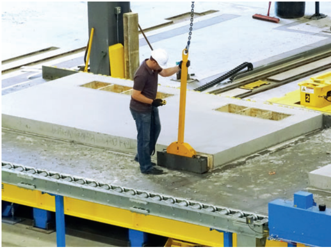
A shuttering robot greatly increases the degree of automation in production. The shuttering is removed manually with the aid of a handling traverse.

The entire circulation plant is controlled via the ebos® control system, eliminating complicated interface problems. Huffcutt benefits from the master computer modules PalBel, WorkPrint and SubLink. PalBel takes over the automatic allocation of the production pallets with concrete parts and allows very simple manual changes afterwards. With the WorkPrint module, worksheets can easily be printed. SubLink is the connection to the shuttering robot, through which the data for the allocation of the pallet surface with shuttering is supplied directly by ebos®.