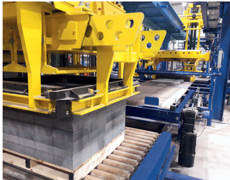
Cubing of the finished products

The keyword “flexibility” is an essential part of the entire corporate philosophy. In conjunction with production, the delivery of products across the country is encompassed by this philosophy. Translift Freight Ltd., a member of the Plasmor Group of Companies, supplies its customers with a modern, professional and highly efficient fleet of crane-off-load block delivery vehicles. Plasmor customers in the South of England and London are serviced by two distribution depots which are supplied daily by a unique rail freight system using Translift's own specially converted rail wagons. The total fleet of over