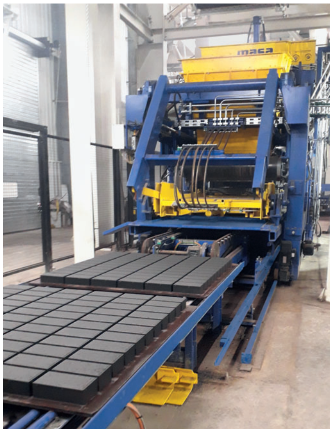
Masa block making machine XL 9.2

The cycle time of the sophisticated production plant is determined by a Masa block making machine with amplitude-controlled vibration. The high-performance machine type XL 9.2 with its additional S-Upgrade (fast execution) has been optimally designed for a reliable, automatic production of