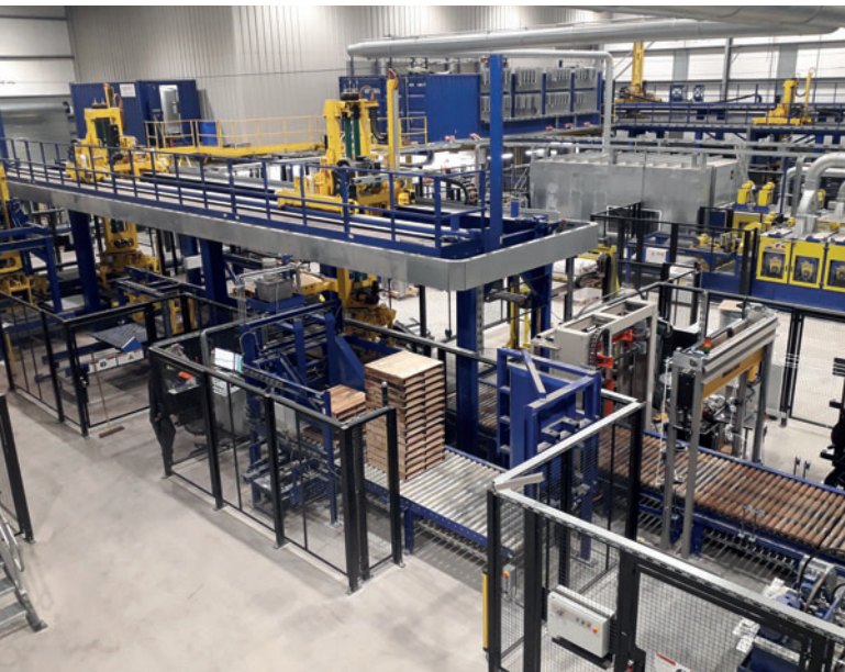
Handling of products