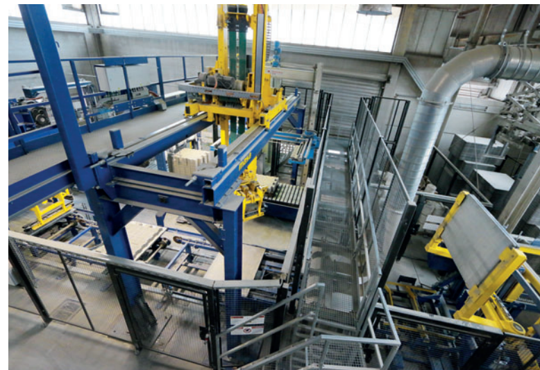
New components for the cubing area and the cross transport