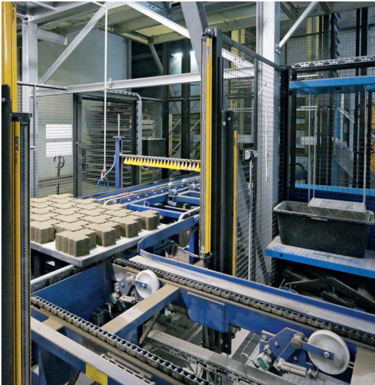
Modular V-belt conveyor system with quality control station

from the further production process at the tilting point of the V-belt conveyor system via a tilting device. This ensures that only the products that are 100% compliant with the strict quality criteria of BWL Betonwerk Linden undergo the curing process. The concrete block making machine does not have to pause during quality control and can continue production continuously.