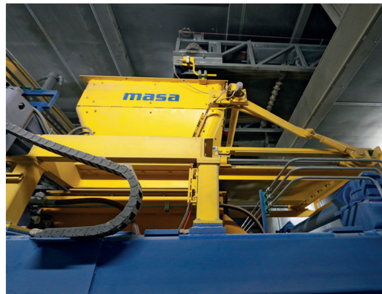
Multi-color device with hydraulically driven slider