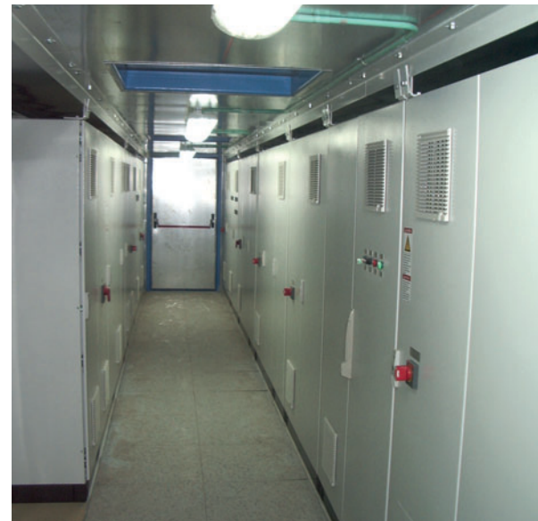
Control panel and power cabinets

Also included in the new control system was the existing production pallet grab in the area of cross transport / production pallet buffer. Here, Masa provided a new bus control, visualization and a new input level for parameters. Thus, both the ease of use was increased and the operational reliability and system availability were optimized.