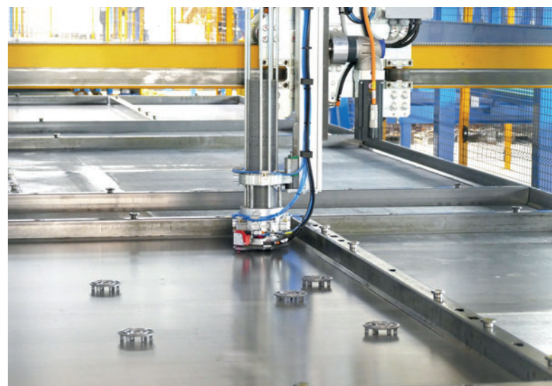
Eder achieves high savings through the fully automatic setting of spacers with the MeshSpacer.