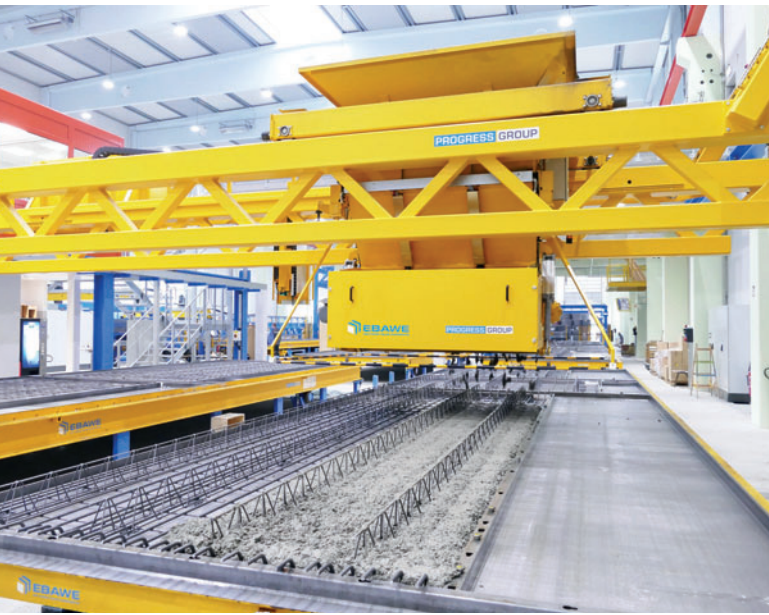
High discharge speed paired with very good concrete dosing capability thanks to the new eCon® Drive automatic concrete distributor

the machine is additionally equipped with an automatic bending device for bending the rod overhangs on the front side. The automatic magnetic crossbeam can not only turn the meshes and insert them into the pallet, but can also place the produced meshes on a stacking trolley for external purposes. These can be used, for example, for other production areas at the site, such as structural precast elements or for the third reinforcement layer for insulated double walls.