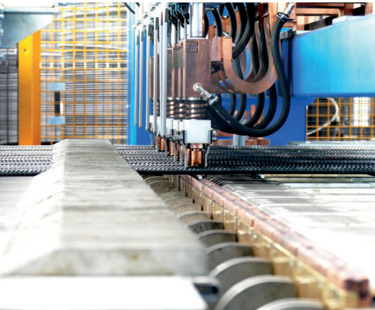
Just-in-time production of reinforcement meshes with the BlueMesh mesh welding machine from progress Maschinen & Automation