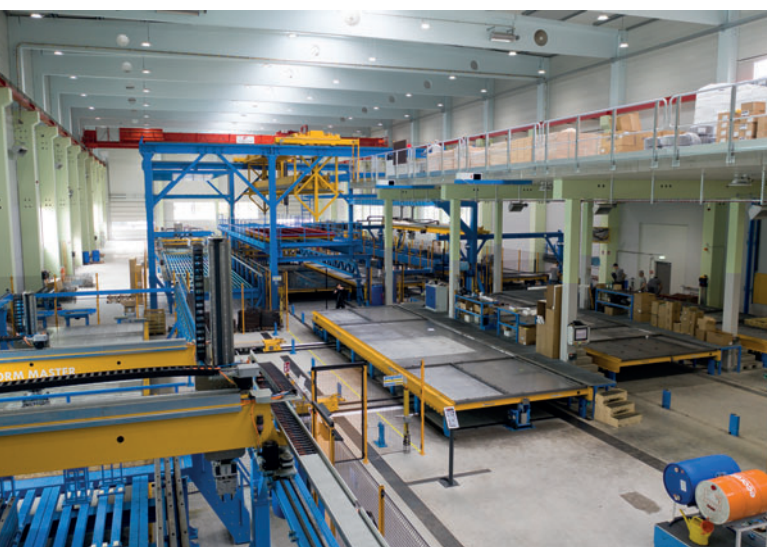
View of the new, highly automated circulation system at Systembau Eder in Kallham

After the acquisition and successful use of a VGA Versa lattice girder welding machine from Progress Maschinen & Automa-