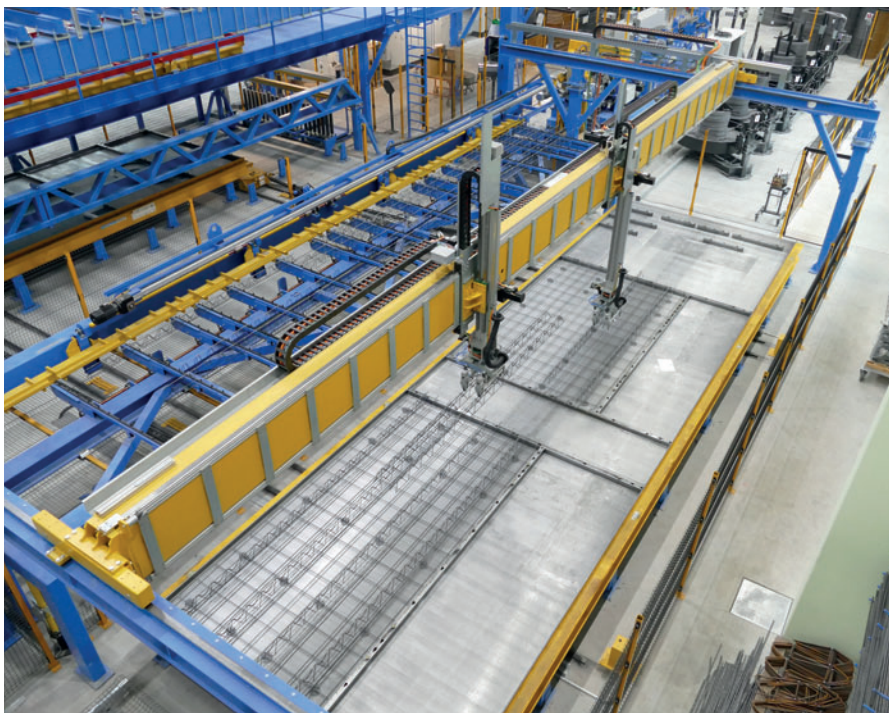
A multi-axis linear robot rounds off the automated reinforcement area in Eder's new plant.

The area of reinforcement production is completely automated in the new Eder circulation system. The Mesh Spacer automatic laying machine positions spacers for the reinforcement meshes on the shuttering surface of the pallet. The insertion is optimized on the basis of calculations of the element size and the weight of the reinforcement, so that an increased savings potential of the required spacers results. The flexible reinforcing mesh welding system BlueMesh, which belongs to the M-System series, convinces by numerous application possibilities in the new plant. In just-in-time production, the mesh welding machine can fully exploit its flexibility and provide meshes in time according to the production requirements of the pallet circulation system. In addition to these advantages, series production of standard meshes is also possible. For the production of precast slabs with in-situ topping,