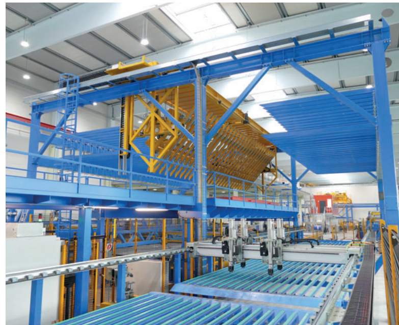
The magnetic crossbeam inserts the meshes into the pallets according to CAD specifications, serves the intermediate buffer, can turn the meshes when longitudinal bars have to be above the cross bars and places the meshes on a stacking carriage.

tion, the Eder Group decided to plan and implement its latest precast concrete element production in close cooperation with the various specialists of the Progress Group. Due to the new areas of application and increasingly modern architec-