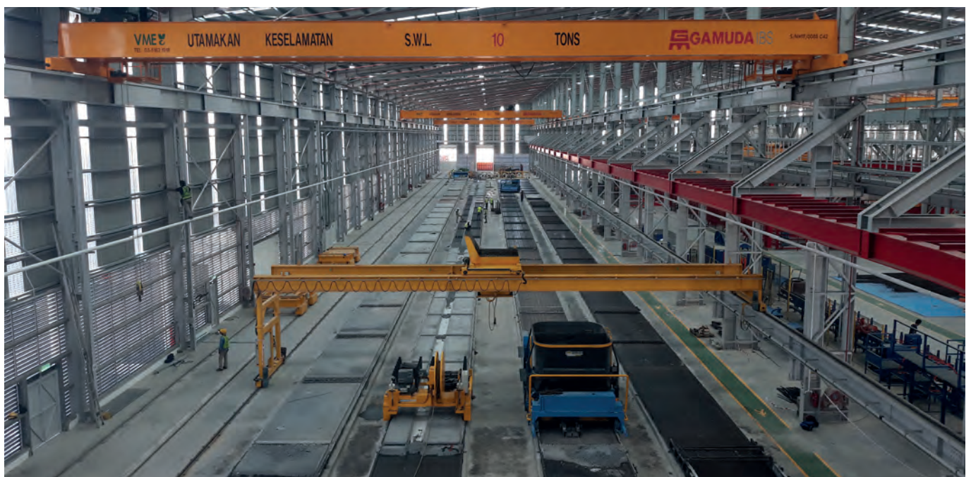
Echo has installed 4 production beds, each 150m long and 2,4 m wide and the Echo Slipformer S-Liner.

Ebawe supplied the equipment for the pallet circulation plant. Progress was responsible for the mesh and lattice girder weld-