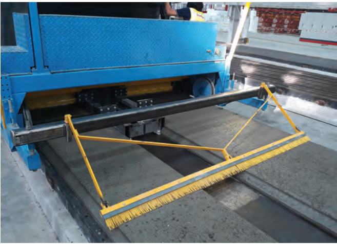
The Slipformer S-Liner from Echo Precast Engineering is a solution for versatile, flexible production requirements.

ing system, as well as all other reinforcement and mesh processing machines.