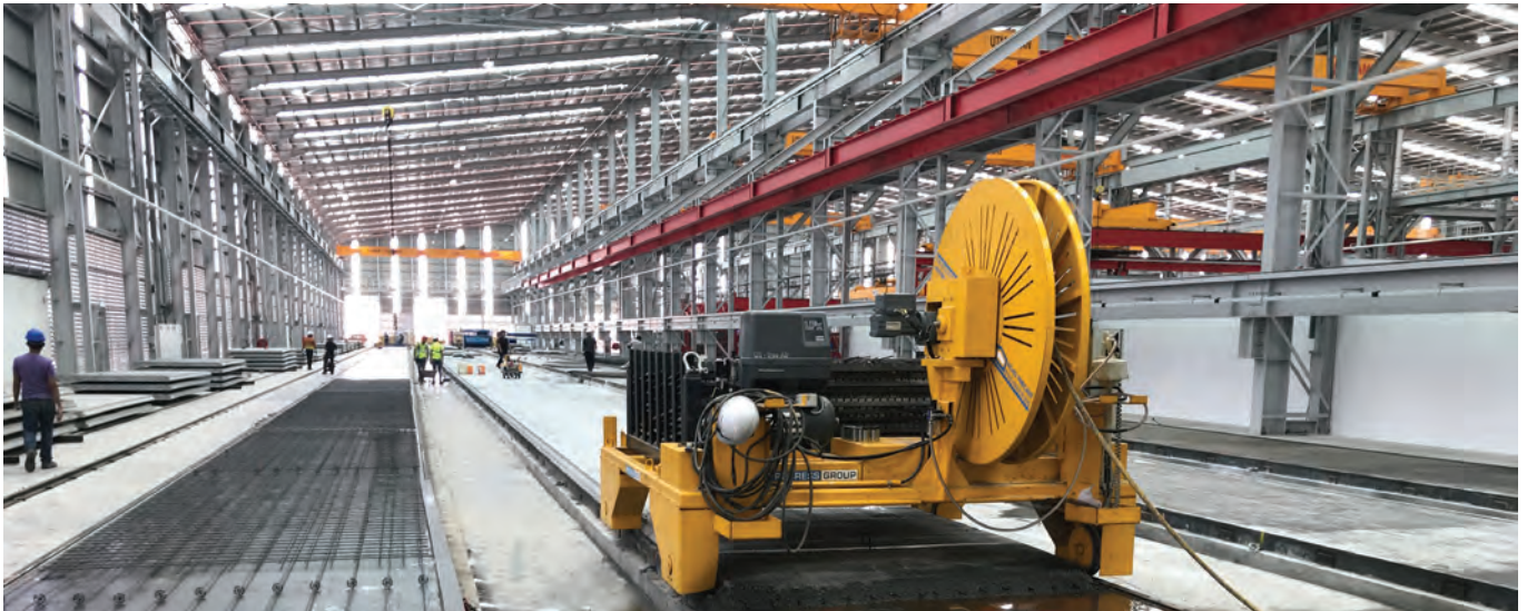
The expansion of the plant with the new production line for pre-stressed concrete elements was also developed by Prilhofer Consulting