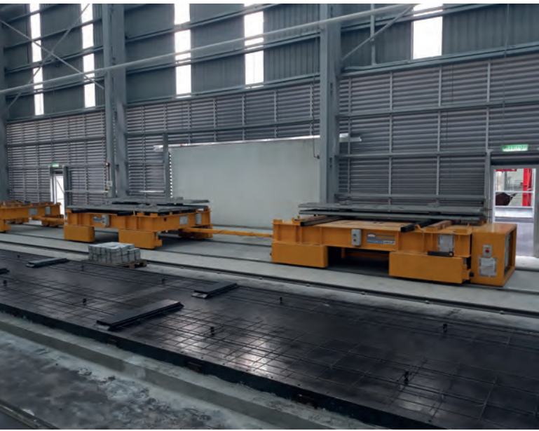
A novelty is the run-off carriage with a load capacity of 30 t.

and mould set. Changing to a completely different product can be completed even more quickly by replacing the production-related module.