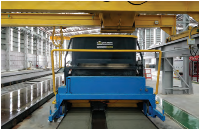
The possibility to produce 2 slabs at the same time with different widths (0,8 m and 1,20 m) stresses the flexibility of the Slipformer S-Liner.