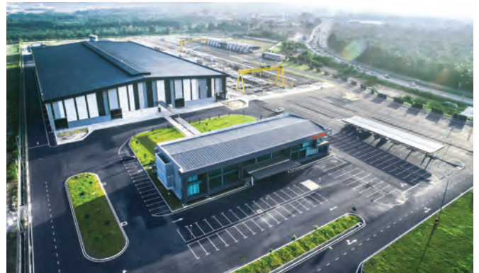
Gamuda has now expanded the plant and has invested in a production line for pre-stressed concrete elements.

The concrete plant commissioned in 2016 was developed by Prilhofer Consulting for an annual output of 1 million square metres of solid walls and precast slabs with in-situ topping