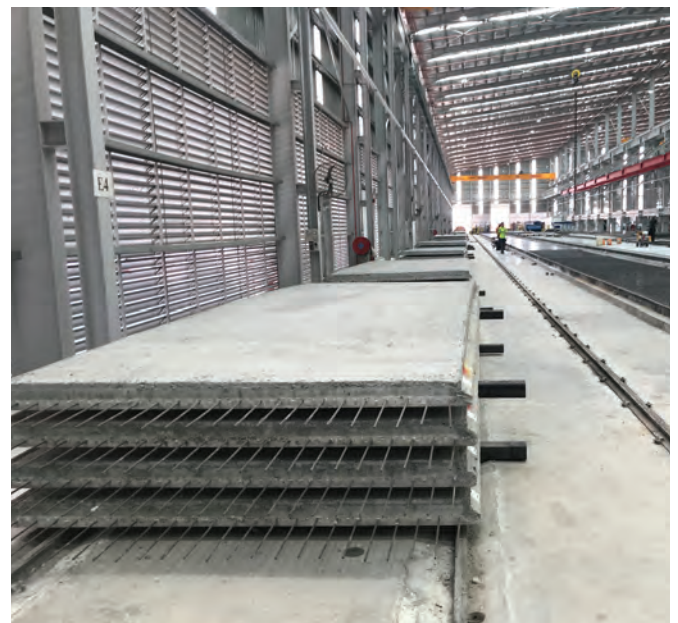
Gamuda can offer the pre-stressed concrete elements in thicknesses of 7 cm, 9 cm or 11 cm.