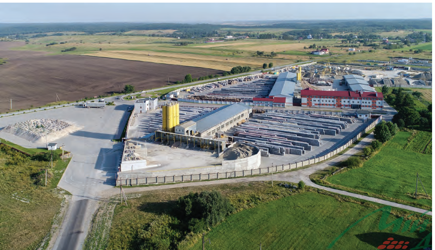
Mii Dvir's modern production facility in Ukraine

Due to the undeveloped raw material market in Ukraine, Mii Dvir made the strategic decision in 2009 to build its own processing plant for materials such as gravel or sand. Three HAVER NIAGARA screening machines, two SBM stone crushers, one CDE EvoWash fine materials classification systems were installed. The materials are sieved, crushed and