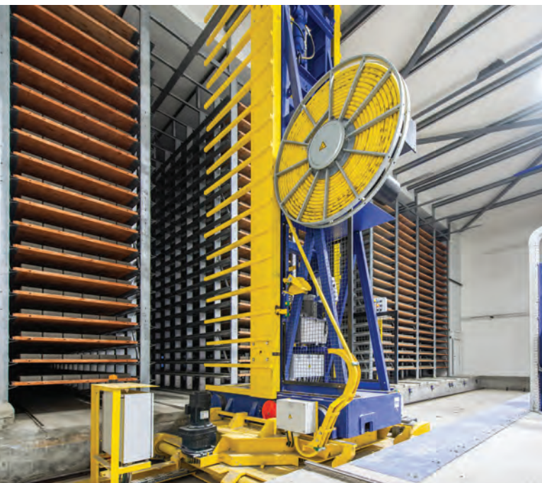
Storage and retrieval of the concrete blocks in the curing chambers

The plant contains the Masa block production machine XL 9.1 with face mix concrete filling unit and an amplitude-controlled vibration as a reliable and technically perfected main component. Precision is an important subject for Masa. That is why the machine is equipped with a solid frame construction with four hard-chromed guide columns (ø 120 mm) for exact parallel positioning of the mold and compaction head, a forcibly synchronized mold guidance for exact demolding of the products and an integrated height limiter function for height-accurate production. The XL 9.1 is also equipped with a fully automatic mold change, which simplifies and significantly accelerates the set-up times. Level measurement in the face mix concrete filling box is done by laser. The "Factory Automation System Tool" developed by Masa enables uniform operation and visualization of all system components.