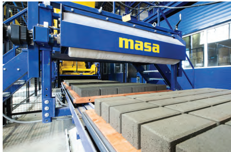
Freshly produced paving stones

November 2018, only one month was left to prepare the site for the installation of the Masa plant, which should start in the beginning of January 2019. The disassembly included both, two old Multilayer Machines (which at that time still accounted for 50% of the production capacity) and the previous curing chamber. For the installation of the new production line, all old machine parts and waste had to be removed residue-free. A particularly tricky task was to lower the foundation 70 cm below the existing level. All demolition work was completed by the 16th of December, after which the foundation work began. 1150 m 3 of concrete was effectively poured in less than 2 weeks, with foundation work getting completed on the 26 th of December.