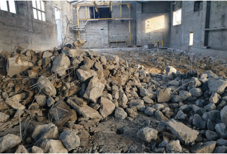
The demolition work progresses

classified into different grain groups. The material is also washed to separate fine raw materials, such as clay or other contaminants. The processing plant for raw materials provides Mii Dvir with huge advantages over competitors, as it allows them to buy wider range of raw materials, out of which specific types of material can later be extracted. This is particularly important in the Ukrainian market, as the quality of the material supplied may fall below the minimum requirements. Additionally, the supply of specific grain groups is limited in the local market, so Mii Dvir has to produce the required grain groups on its own. With this investment, Mii Dvir is now able to supply itself with a wider range of materials that are of higher quality than those readily available to the rest of the market.