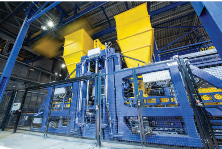
Masa Concrete Block Making Machine XL 9.1