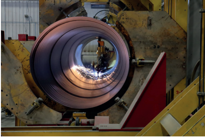
First of all, an endless steel cylinder is produced from sheet steel, from the coil, using spiral seam welders and moulding equipment.

very high strength over the entire pipe length. Potential defects that may later arise in the bedding of the pipes therefore represent a significantly lower risk for the concrete pressure pipes than for other types of pipe.