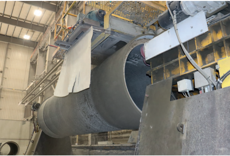
The coating plant applies a protective layer of concrete cement to the pre-stressing wire.

In the next step, the steel cylinders comprising the welded end rings undergo a hydrostatic leak test. Not one drop of water may emerge from any of the seams; otherwise, the cylinder would not be suitable for use in pressure pipes, and would definitely not be released for further production. The required immediate 100% tightness was mastered very quickly, and therefore nowadays virtually all the steel cylinders produced pass the leak test.