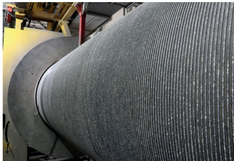
The pre-stressing wire is applied over the entire length of the tube.