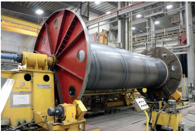
The end rings are then welded, over the entire periphery of the steel cylinder in order to be coupled and sealed.