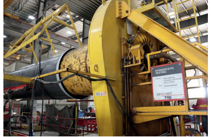
The steel cylinders comprising the welded end rings undergo a hydrostatic leak test.