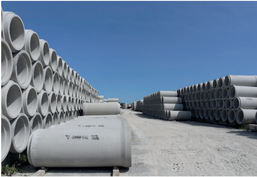
Decast external storage areas

What's more, in addition to concrete pre-cast components for waste water and rainwater drainage, Decast also manufactures numerous special prefabricated components, such as supporting walls.