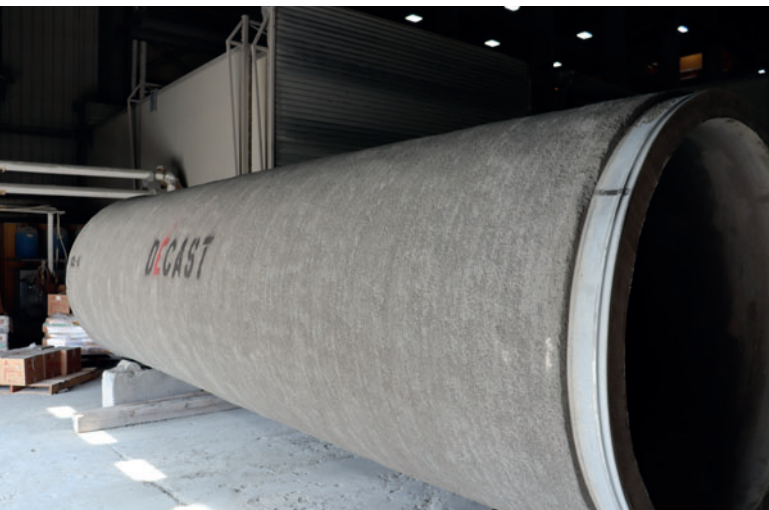
Finished pressure pipe in the quality check

In the next step, Schlüsselbauer handling equipment is used to erect the steel cylinders from the horizontal position and to insert them into a pipe mould of the Besser packerhead pipe machine. The tubular machine then produces the concrete lining of the pressure pipe; essentially a concrete pipe in the steel cylinder. This cylinder is the outer shell skin in pipe manufacture. The result is a two-component pipe comprising an outer steel casing and a concrete core.