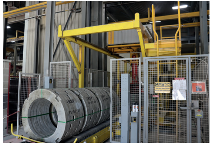
In operation for years: Schlüssellbauer Technology Ringmaster