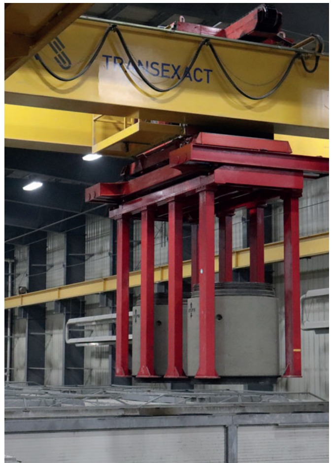
Also successful in continuous operation: Schlüssellbauer Exact pipe and manhole component machine