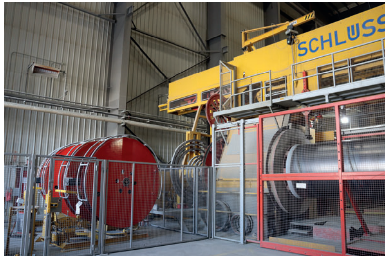
The high-speed pre-stressing machine from Schlüsselbauer Technology has been integrated into the production line, significantly improving the process.