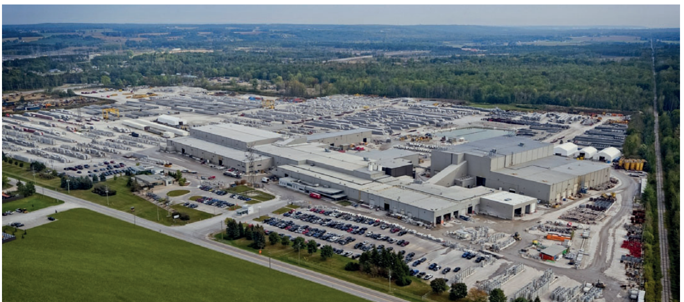
Decast Ltd. company premises in Utopia

Bridge construction is a very important area of operation for Decast. The company produces bridge girders up to 50 m in length, as well as modular bridge systems. The advantages of the very rapid construction progress using concrete pre-cast components are undeniable, which means this construction method is of ever-increasing significance and demand at Decast.