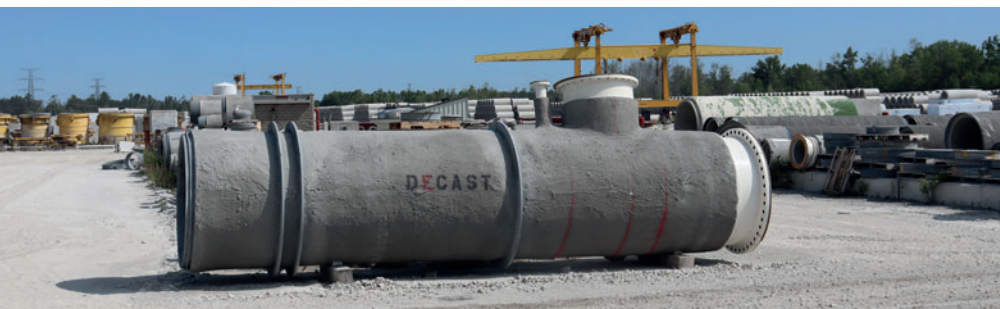
Since 2003, Decast has also been producing concrete pressure pipes for transporting drinking water