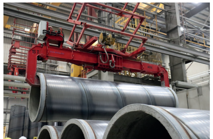
Safe and quick product handling using telescopic grabbers