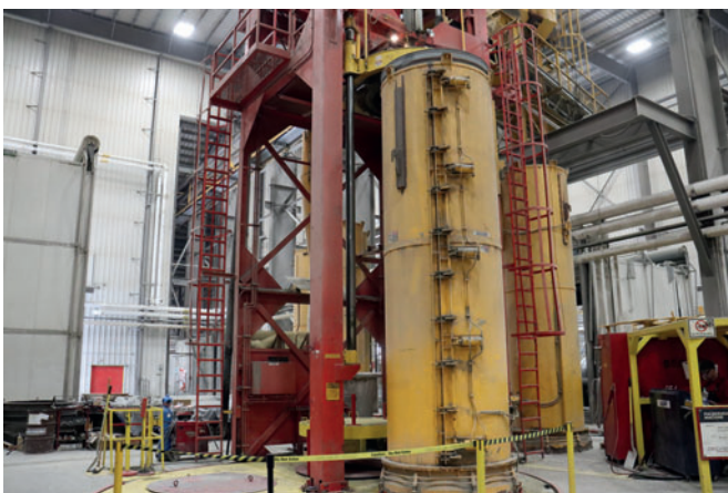
Packerhead pipe machine for applying the inner concrete core