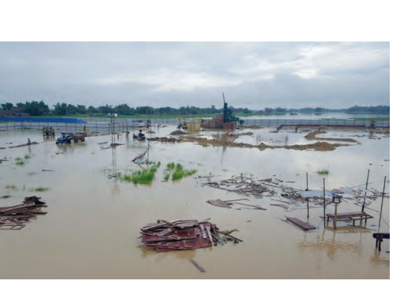
Flooding of the site after heavy monsoon rains

Masa was shortlisted as a possible business partner right from the start. Factory visits to existing Masa plants in neighboring India as well as a visit to Masa Andernach, Germany concluded fruitfully. In the course of the negotiations, it quickly became apparent that - due to previous intensive researches in India - beautification models from Dubai, Middle East and Europe with very precise ideas about the future "Next Generation" product portfolio needed to be introduced in Nepal. In addition, the company founders had extensive knowledge and experience in both the manufacturing and distribution of