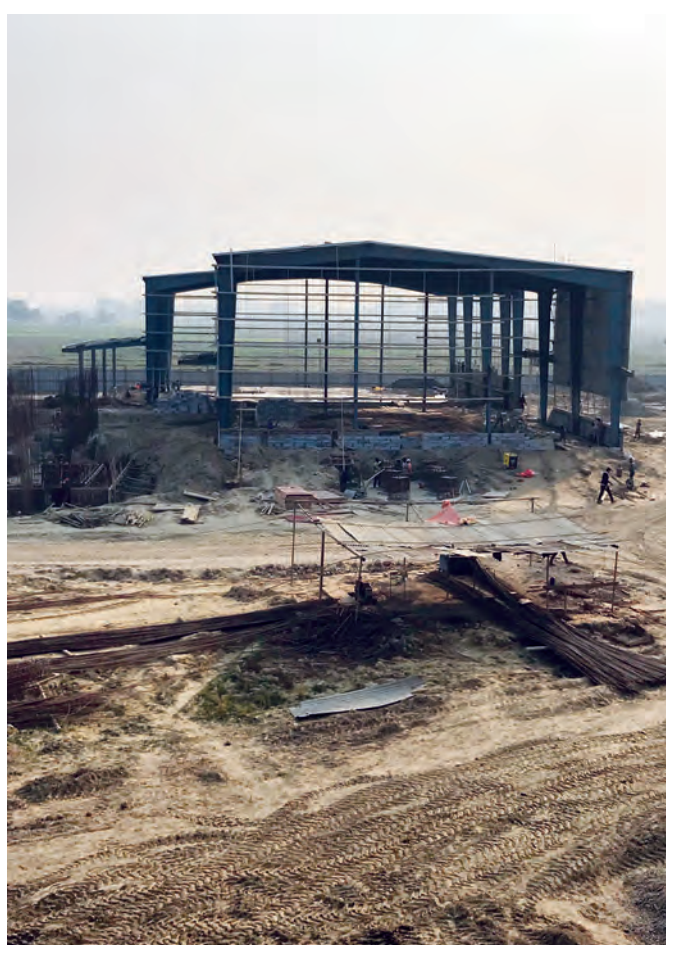
The new production facility in Nawalparasi, Ramgram arises