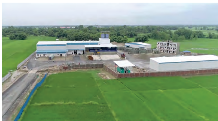
Since June 2018, high-quality concrete blocks and pavers are produced in Ramgram