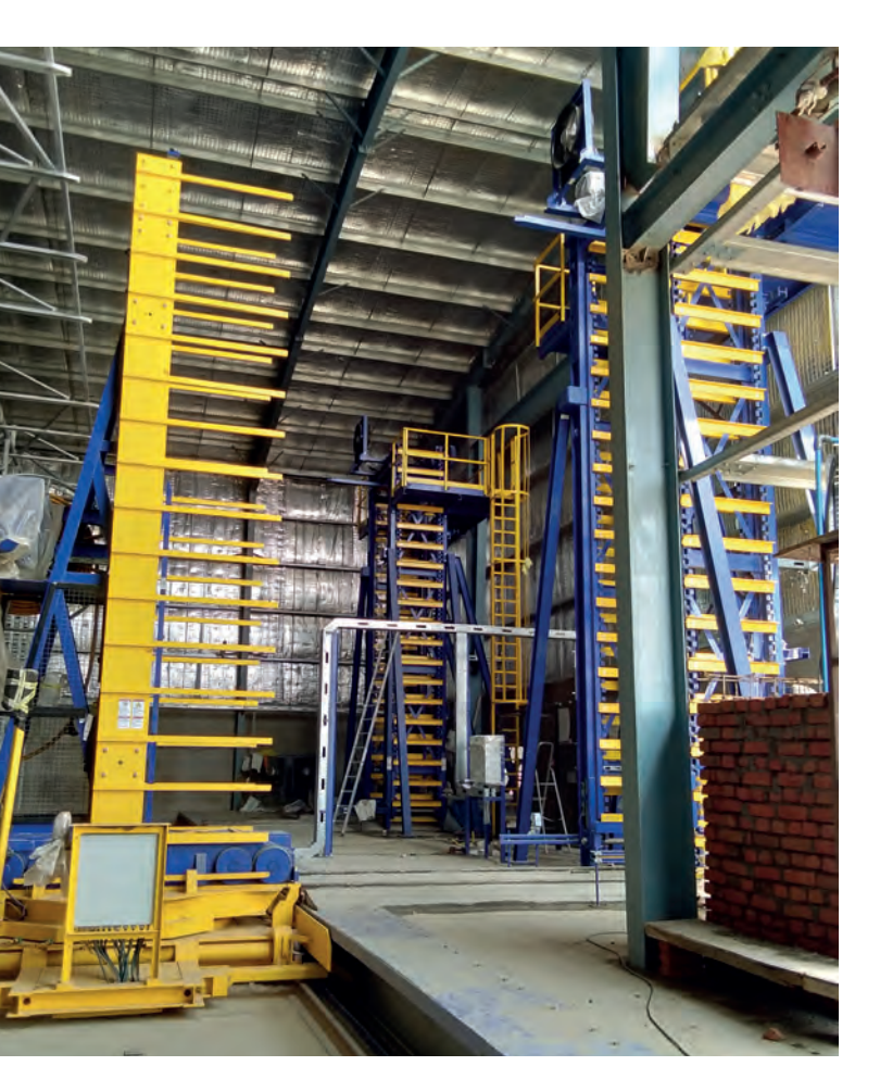
Assembly of elevator, lowerator and finger car