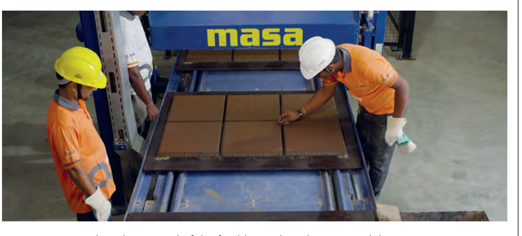
Manual quality control of the freshly produced concrete slabs