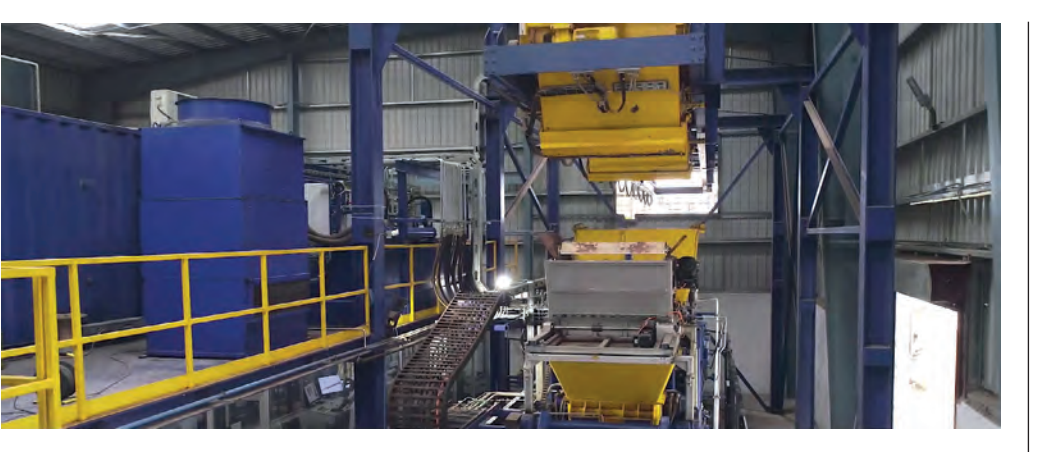
Concrete transport via bucket conveyor to the concrete block making machine

other things, an automatic mould change package and the integration of a height limiter function for high-precision production.