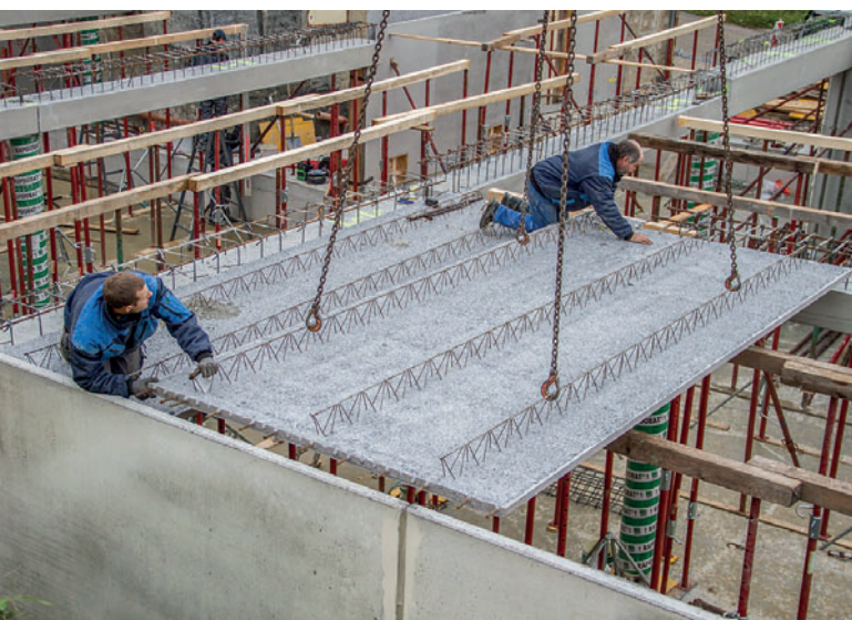
In the modern pallet circulation plant from Ebawe Anlagentechnik, Jungwirth manufactures precast slabs with in-situ topping and double walls with and without insulation.

The circulation plant was also equipped with the ebos® control system from Progress Software Development GmbH, the software company of the Progress Group. ebos functions as a total solution for work preparation, production and process analysis, which accompanies all aspects of the production process in a consistent manner.