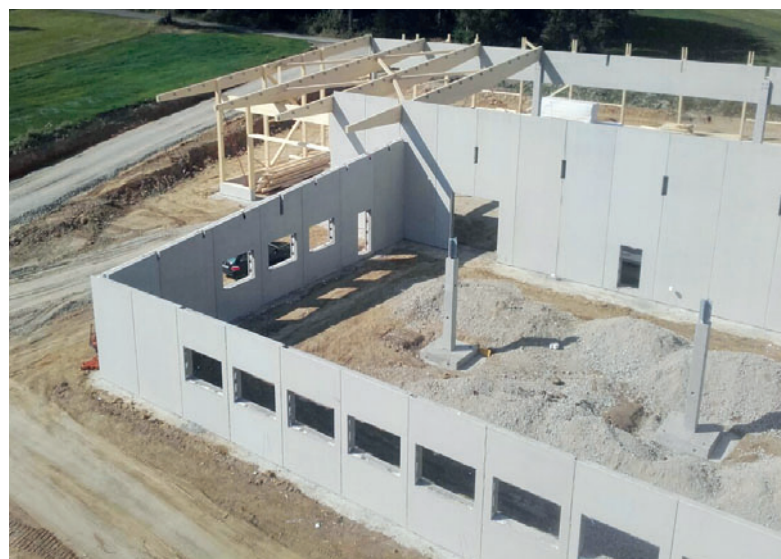
The Lower Austrian precast concrete company supplies products for buildings and underground construction from Linz to Vienna.