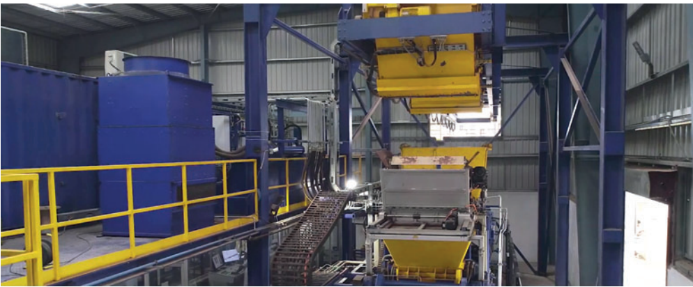
Concrete transport via bucket conveyor to the concrete block making machine

other things, an automatic mould change package and the integration of a height limiter function for high-precision production.