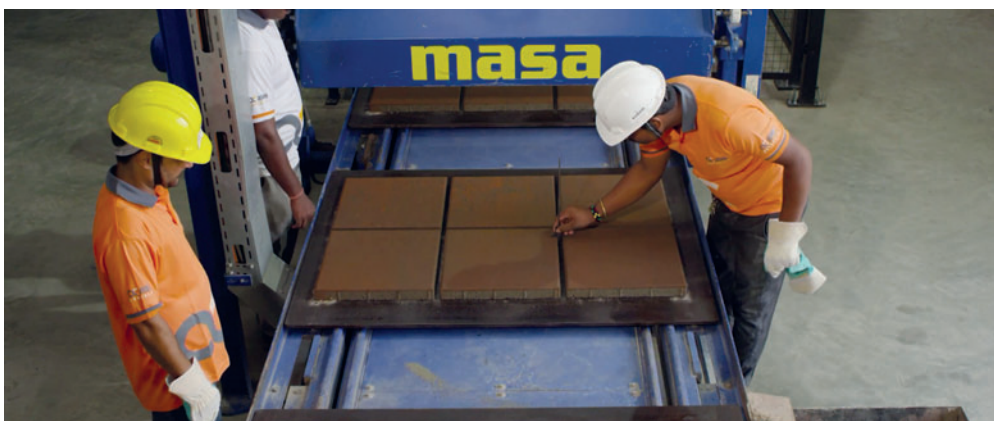
Manual quality control of the freshly produced concrete slabs