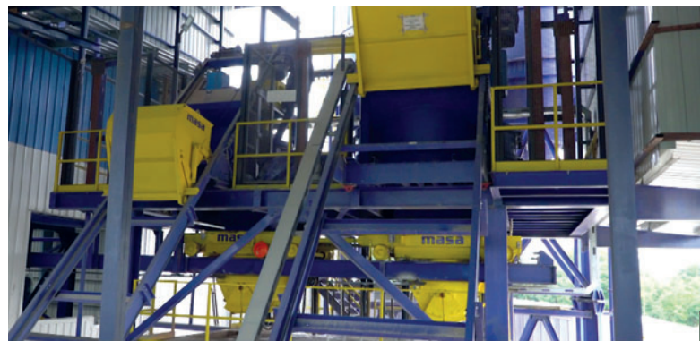
Aggregate hoists to the Masa concrete mixers

building materials through their relationships with their existing business portfolios. When choosing the location for the new Masa L 9.1 plant including a Masa dosing and mixing plant, the logistics were well considered to have the plant at Nawalparasi, Ramgram, not far from the historical city of Lumbini, an UNESCO Heritage, the birthplace of Siddhartha Gautama, the founder of Buddhism.