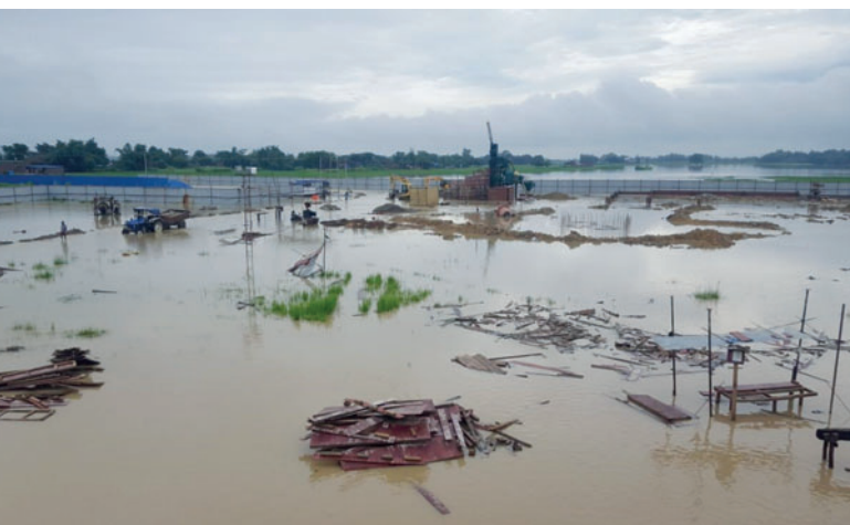
Flooding of the site after heavy monsoon rains

Masa was shortlisted as a possible business partner right from the start. Factory visits to existing Masa plants in neighboring India as well as a visit to Masa Andernach, Germany concluded fruitfully. In the course of the negotiations, it quickly became apparent that - due to previous intensive researches in India - beautification models from Dubai, Middle East and Europe with very precise ideas about the future "Next Generation" product portfolio needed to be introduced in Nepal. In addition, the company founders had extensive knowledge and experience in both the manufacturing and distribution of