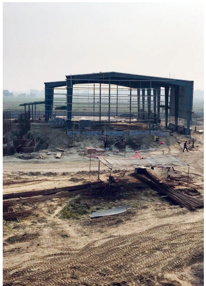
The new production facility in Nawalparasi, Ramgram arises