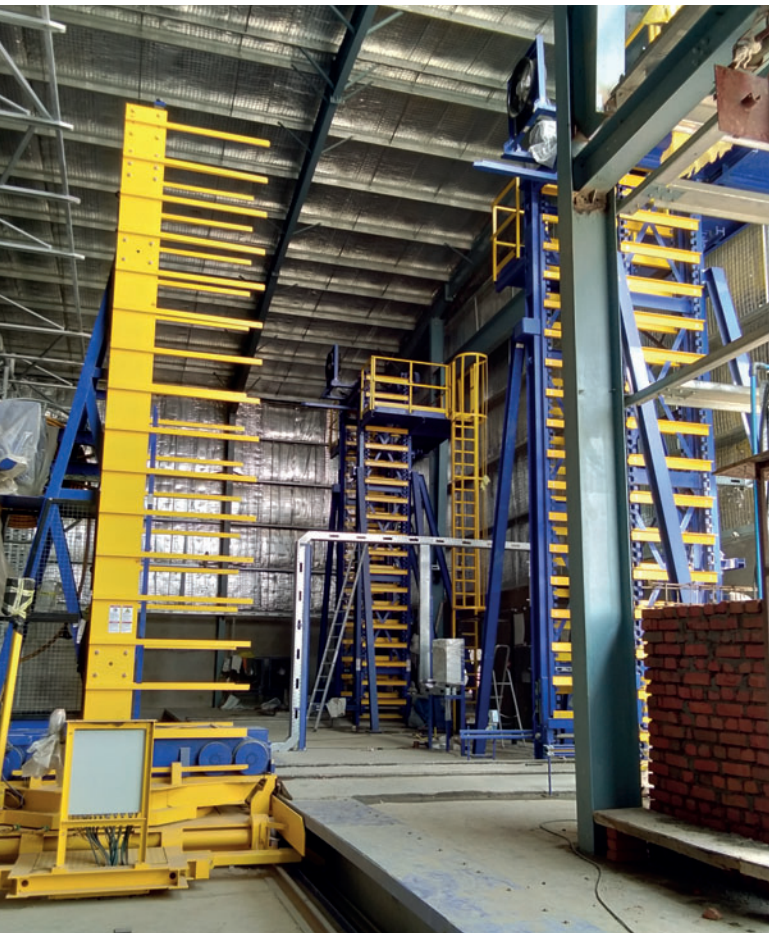
Assembly of elevator, lowerator and finger car