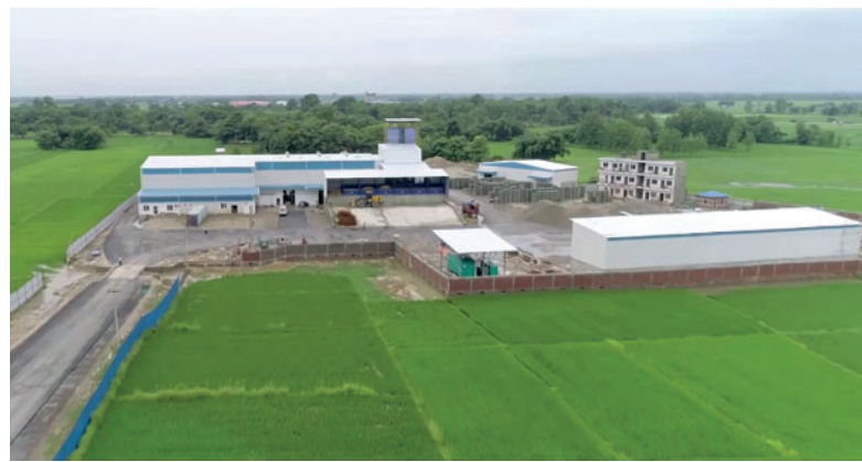
Since June 2018, high-quality concrete blocks and pavers are produced in Ramgram