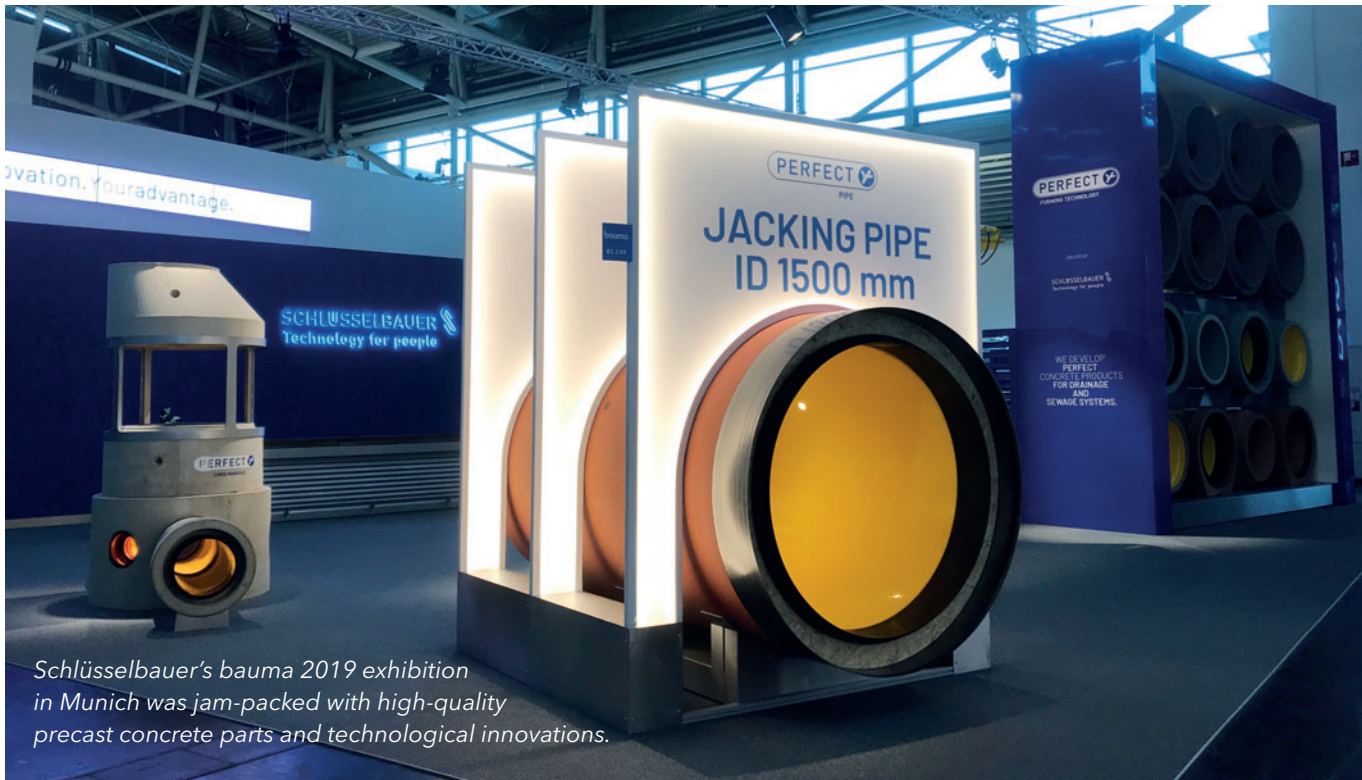
Schlüsselbauer's bauma 2019 exhibition in Munich was jam-packed with high-quality precast concrete parts and technological innovations.

for a pipe with a HDPE liner and connector to have a maximum diameter of 1,500 mm, and Perfect manhole bases with an individual channel can already be manufactured up to DN 2100. Even with components of this size, engineers have the freedom to choose the junctions, diameter and gradient of the pipes that are to be connected. The EPS negative channels required for concreting with self-compacting concrete are manufactured in a resource-friendly manner in the Perfect manufacturing system. Manhole bases of DN 600 to DN 2100 with channel diameters of 100 to 1,000 mm can be produced and sold at Perfect's consistently high quality standard.