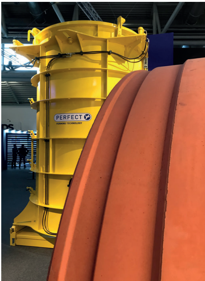
The custom-fit design of the pipe with a sealing chamber at the tip end demonstrates the possibilities offered by the sophisticated Perfect Forming Technology manufacturing system.

being used instead of welding to ensure more efficient installation, even in pipes with larger nominal widths. With the Perfect Pipe system, manufacturers of concrete jacking pipes also have the option of offering suitable concrete-based products for wastewater collectors that are subjected to critical chemical attack. While the margins that can be achieved for surface drainage with mass-produced products are generally shrinking under competitive pressure, products such as the DN 1500 corrosion-resistant concrete jacking pipe offer unique selling points both for the manufacturer and, from an overall market point of view, for sewer construction and trenchless installation.