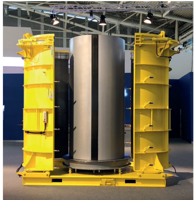
As a way to showcase the Perfect Forming Technology manufacturing system, Schlüsselbauer displayed the same mould with maintenance-free shrink core and careful tip end de-moulding that was used to produce the pipe exhibit just a few days before.