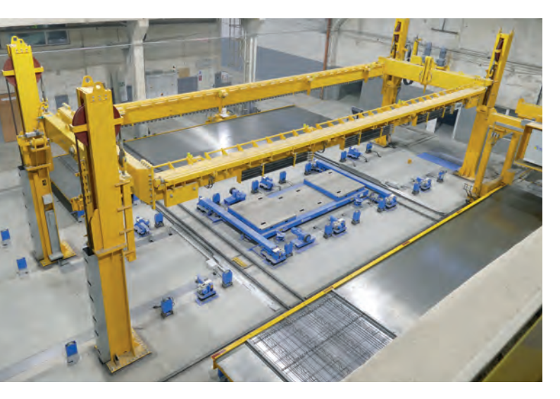
The pallet turning device is the new center piece for the carrousel's plant double wall production.