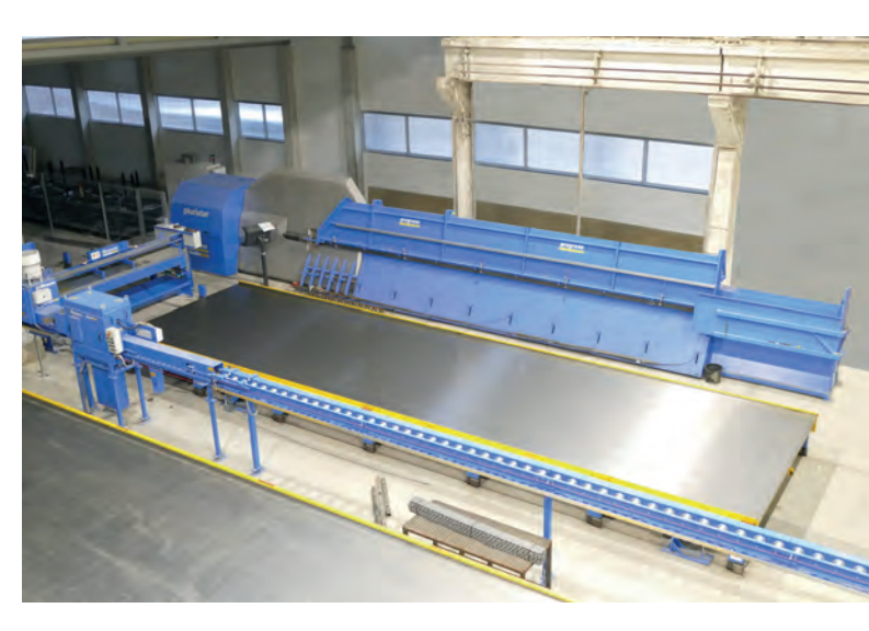
The Pluristar by progress Maschinen & Automation is an automatic stirrup bender, straightener and double-bending machine in one. It was perfectly integrated into the new Ebawe carrousel plant.