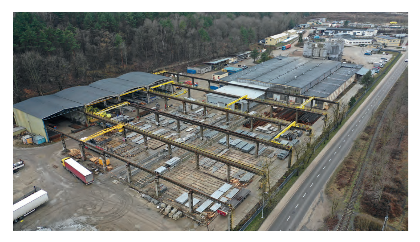
Only 10 workers are running the new Ebawe carrousel plant in the city of Kolbudy.

ucts, 10% on ready-mix concrete, in addition to a few other business activities, such as reinforcement mesh and trusses. Though the company's regional stronghold traditionally is in greater Kolbudy near Gdansk, it covers a radius of roughly 100kms, including Gdansk, Sopot, Gedynia and Rumia. Even beyond Poland, inBet successfully markets its precast products to the south of Sweden.