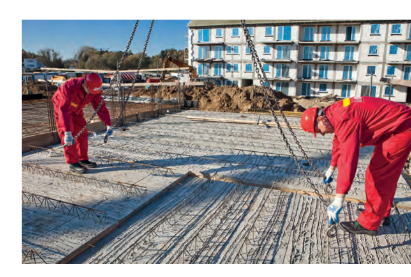
Filigree slabs allow for quick and tailor-made floor slab production and installation.

Finally, thanks to Progress Group's in-house software and master computer ebos, the best possible overall control of the carrousel plant can be ensured. Among others, ebos offers functions such as an automatic pallet assignment, print modules for work sheets, as well as label and report printing modules etc.