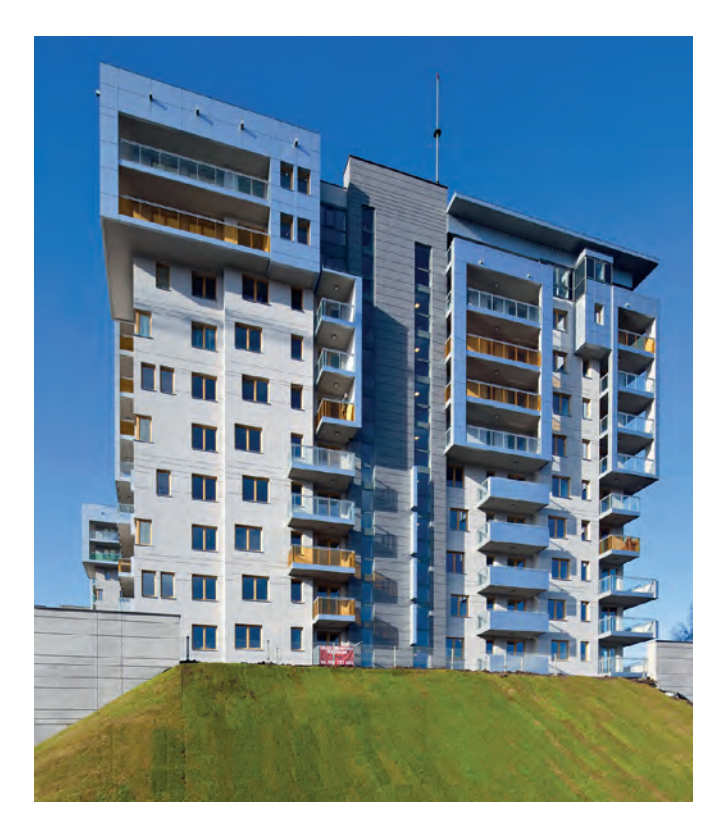
Thanks to the usage of precast elements, shorter construction times were reached, for example in the Osiedle City Park Project.