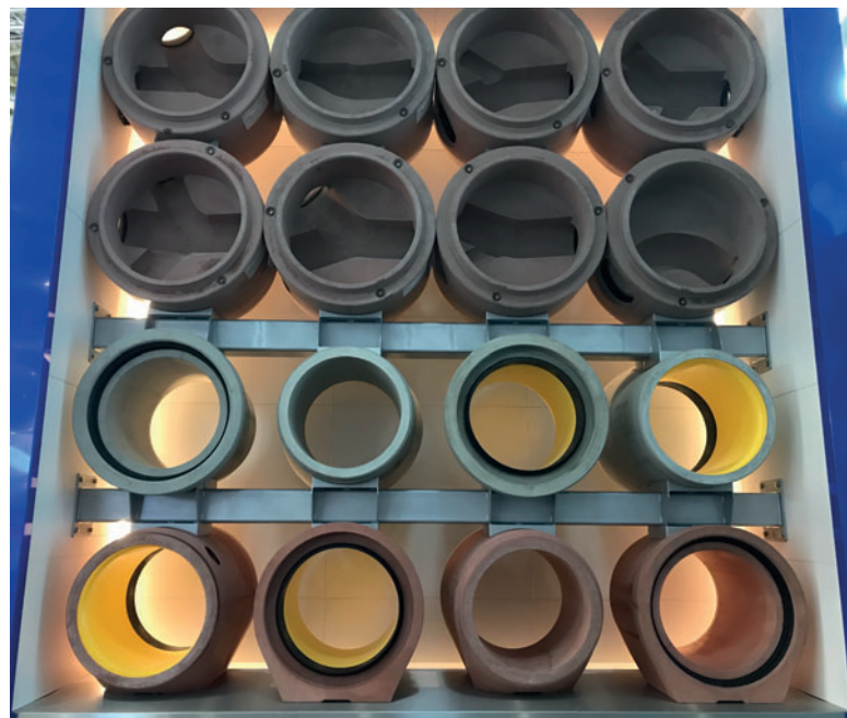
Schlüsselbauer Technology’s collection of pipes and manholes at bauma impressively showcased the variety of options for increasing the added-value in precast part factories with the manufacture of high-quality components.

Using the DN 1500 Perfect Pipe jacking pipe as an example, Schlüsselbauer Technology’s exhibition proved that with extraordinary products, you can break into very interesting niche markets. While the Perfect Pipe concrete-plastic composite pipe covered the nominal width range 1 of DN 250–600 at its bauma premiere in 2010 (cf. BWI 3/2010) – placing it firmly in the field of non-accessible wastewater collection systems – the range of products is expanding further beyond this nominal width range. The idea of creating a wastewater pipe with