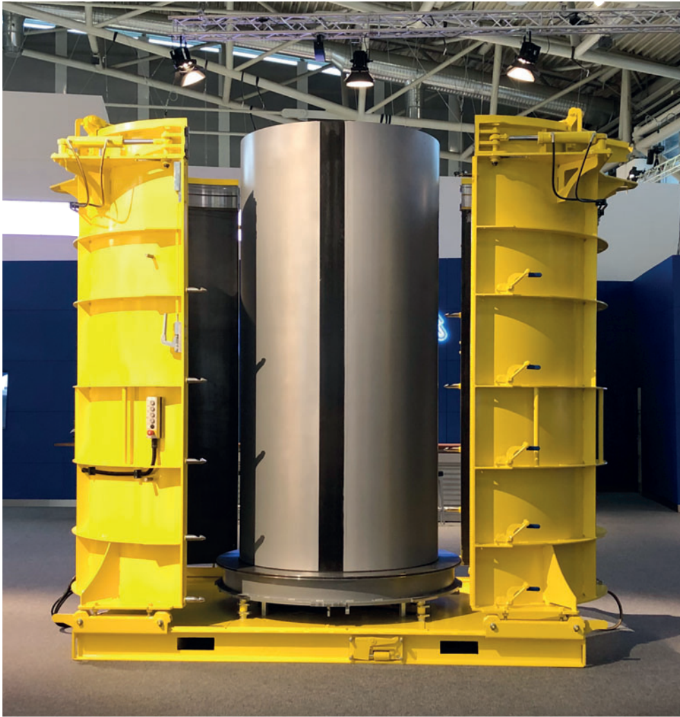
As a way to showcase the Perfect Forming Technology manufacturing system, Schlüsselbauer displayed the same mould with maintenance-free shrink core and careful tip end demoulding that was used to produce the pipe exhibit just a few days before.

drainage with mass-produced products are generally shrinking under competitive pressure, products such as the DN 1500 corrosion-resistant concrete jacking pipe offer unique selling points both for the manufacturer and, from an overall market point of view, for sewer construction and trenchless installation.