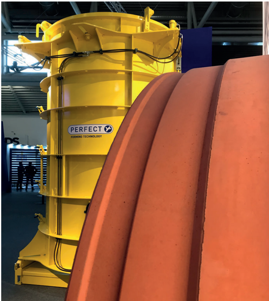
The custom-fit design of the pipe with a sealing chamber at the tip end demonstrates the possibilities offered by the sophisticated Perfect Forming Technology manufacturing system.