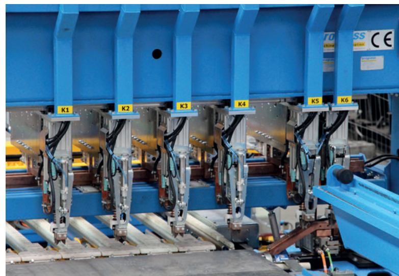
The welding machine is designed as a flexible production plant for reinforcement mesh directly from coil according to individual specifications.