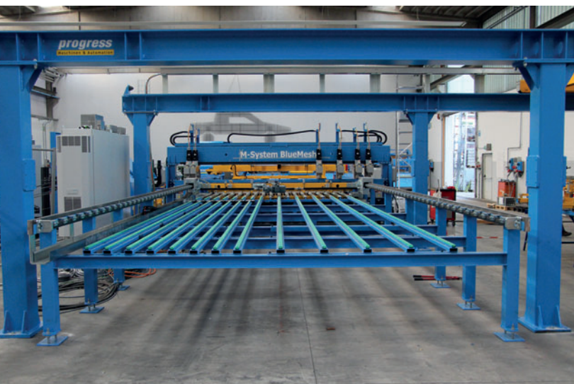
Sansiri integrated a new BlueMesh M-System, a mesh welding machine from progress Maschinen & Automation into their carousel plant for precast concrete elements.

A large amount of the Sansiri housing projects are built with precast concrete elements, as this construction technology allows to produce high-end quality prefabricated parts that can be installed easily and efficiently at the construction site. With the new BlueMesh M-System the automatization of the pre-