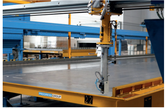
With the help of a plotter, the precast slabs’ contours as well as electricity boxes or other elements, are plotted on the pallet in order to make the manual shuttering process precise and time saving.