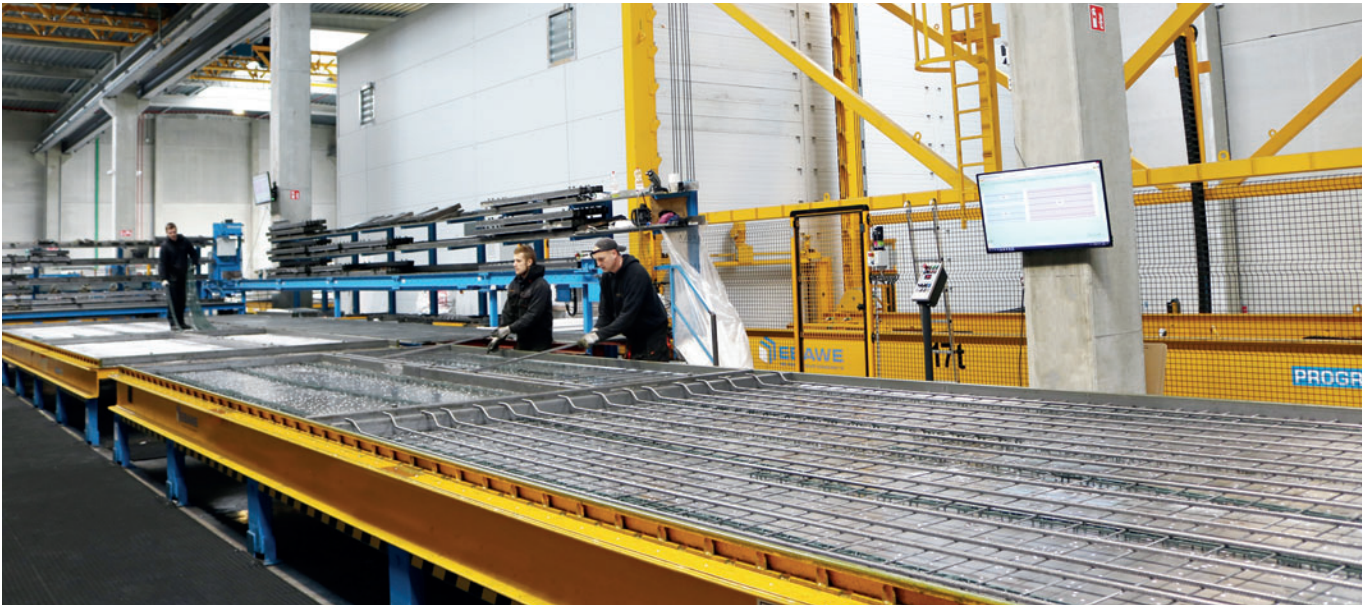
The number of workers, both in Predalco's old and new carousel system, with only 8 individuals per plant is very efficient.