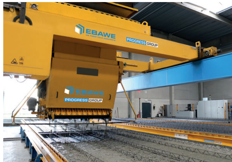
The automatic concrete spreader ensures an even and optimised distribution of the concrete into the moulds.

“We were very satisfied with the experiences made with our first production system.” continues Van der Stock. “However,