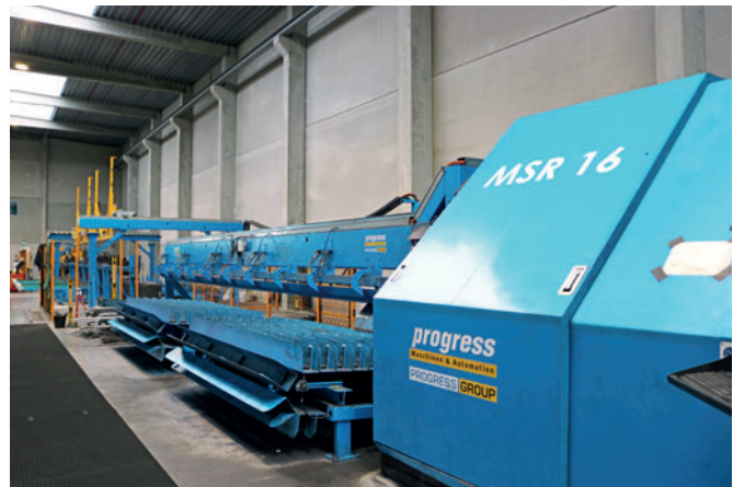
The Progress MSR 16 straightening and bending machine works off coil and optimizes the flow of production. Low storage costs and easier material handling ensure a cost-effective production.