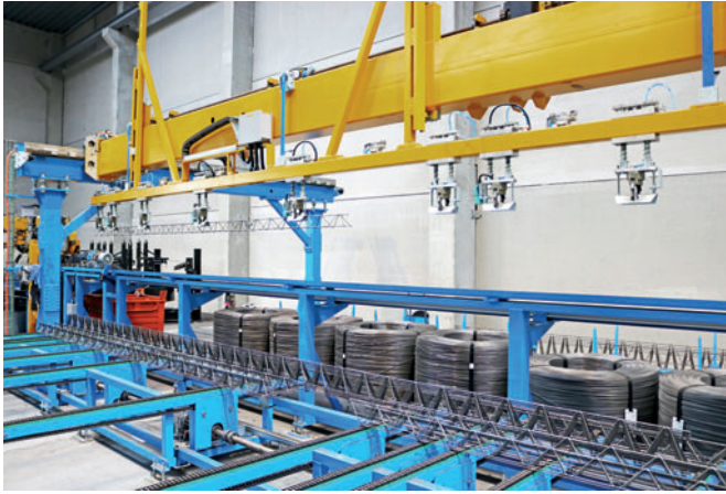
The Progress lattice girder welding and handling machines of the VGA Versa series represent the best in flexible, just-in-time lattice girder production.

only be reached through a strong differentiating factor, which finally brought the breakthrough and allowed the company to grow to 180,000 sqm after two years, and approx. 500,000 sqm of slabs in 2018.