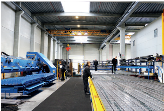
Already in the planning phase of the new carousel plant, Predalco focused on a combined carousel and reinforcement machinery approach to ensure a smooth overall production process.

The first year ended with a disappointing total production output of 60,000 sqm of precast slabs. In a very short time, Predalco had to learn that in order to enter the market, they had to be able to challenge the big players and that this could