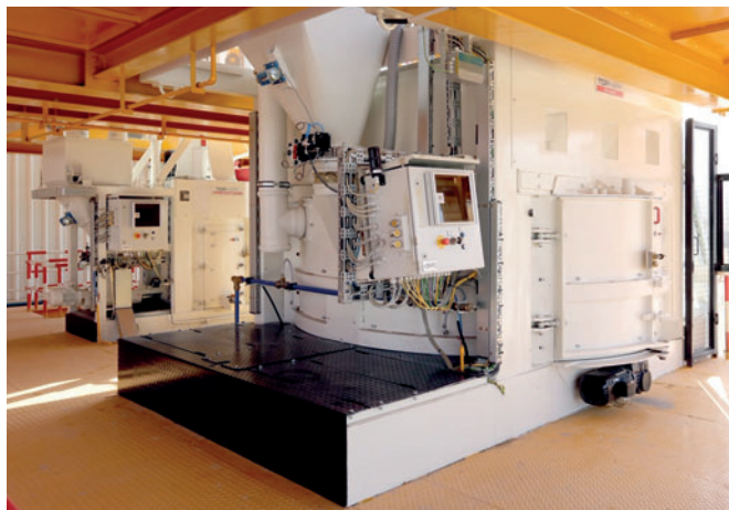
SM3375 / SM400 Mixing plant

The RH 2000-3 is a high end production machine which combines many years of machine building experience with the latest proven M-Version technology, from the most exact