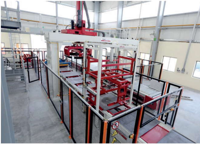
Fully automatic transfer and handling system

the permanent lubrication of the bearings, running dry inside the casing is impossible.