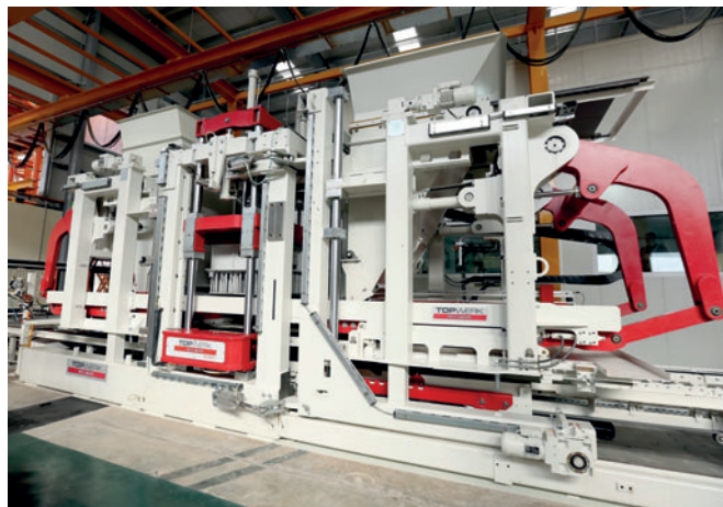
Hess RH 2000-3