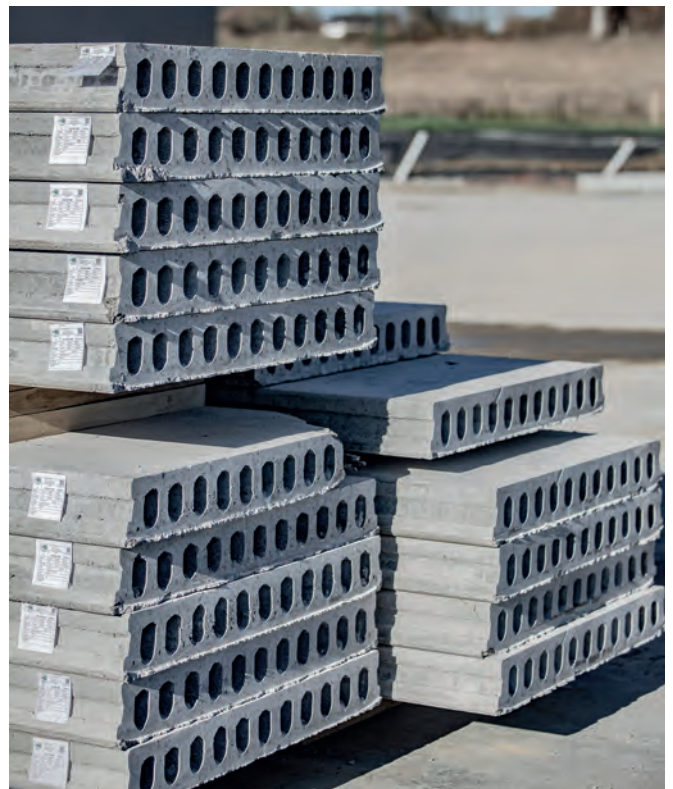
Larco produces with 12 employees a range of prefabricated concrete elements such as hollow core slabs, columns, wallpanels, socles as well as solid flooring elements.