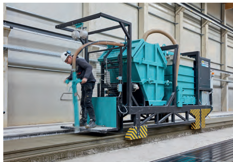
A multi-angle saw, a fresh concrete saw, an automatic plotter, a concrete distributor an absorber and a multifunctional trolley round up the production equipment delivered by Echo Precast.