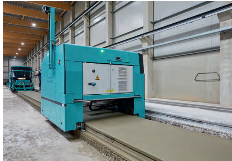
The automatic plotter draws either project identification data or patterns for areas that needs to be cut out of the slabs.

data or patterns for areas that needs to be cut out of the slabs. It can draw either on top of the slabs or on the side parts. Two different sawing machines, one for fresh concrete and one multi-angle sawing machine (MAS) which is used for cured concrete cut off the areas marked by the plotter.