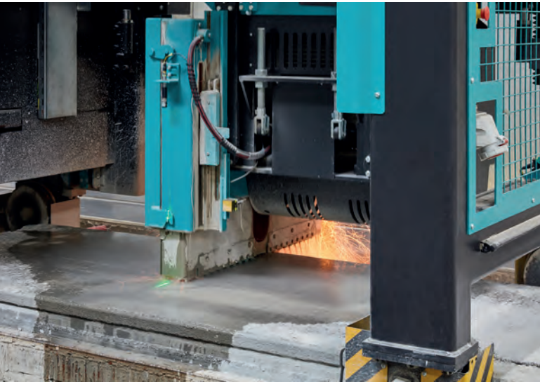
The multi-angle saw machine is able to cut to the desired length at 90 degree angle, lengthwise sawing at 0 or 180 degrees, and diagonally at all angles between 90 and 0 degrees as well as 90 and 180 degrees.