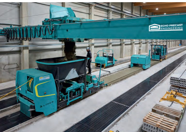
Larco is producing pre-stressed precast concrete elements on four production lines. Heart of the production is the Slipformer S-Liner® from Echo Precast Engineering.

Echo Precast was the partner of choice to deliver further equipment that rounds up the production process. A computer transmits data either by USB-stick or wireless to the automatic plotter, that draws either project identification