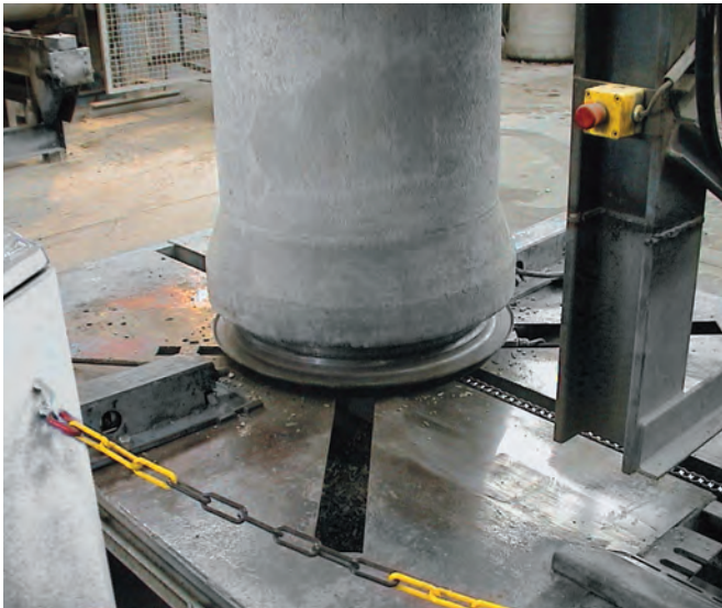
Base pallet extraction station