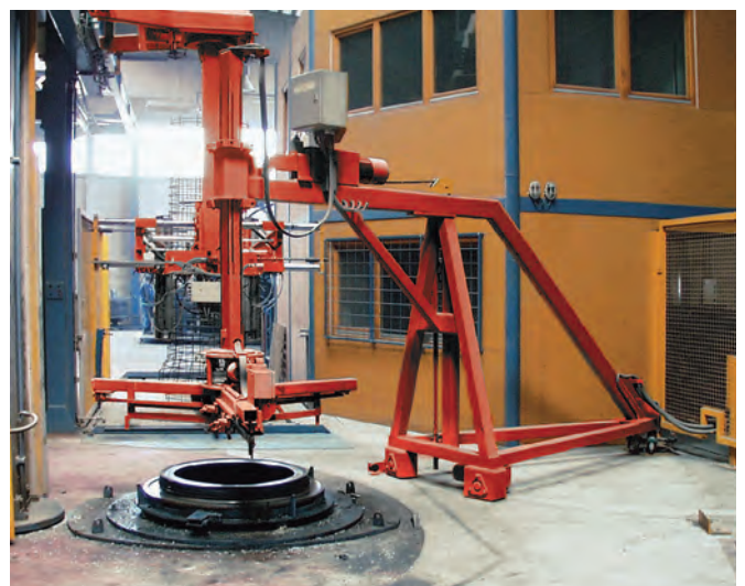
Fully automatic base pallet insertion equipment