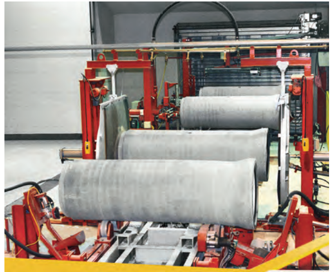
Prinzing-Pfeiffer offers a pipe testing line to monitor pipe quality

This is expandable with a supplementary milling cutter to create a seal groove at the spigot. This makes it possible to produce a pipe with a subsequently installed gasket. The automatic leak test is carried out with a vacuum pipe testing device using the vacuum differential method. A pipe labelling device is used to identify the pipes in accordance with customer requirements. In addition to standards and production data, this also allows application of the company name or additional information.