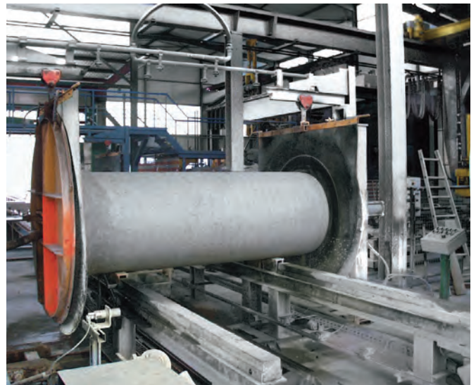
Vacuum pipe testing device for the leak test

The flexible and versatile configuration allows adaptation to customer needs and further optimisation of concrete pipe production in the future. ■