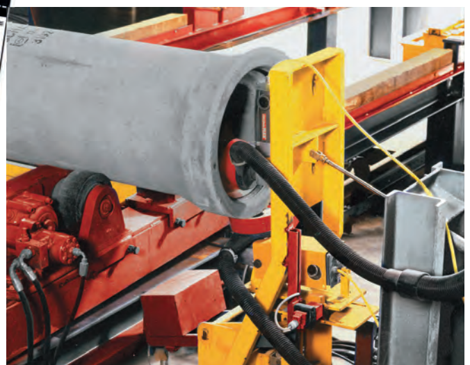
Deburring station for processing internal and external bell diameters and the spigots of concrete pipes