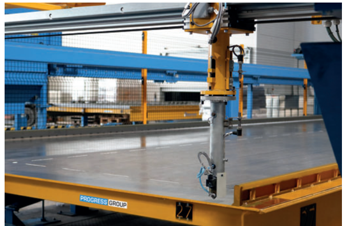
With the help of a plotter, the precast slabs' contours as well as electricity boxes or other elements, are plotted on the pallet in order to make the manual shuttering process precise and time saving.