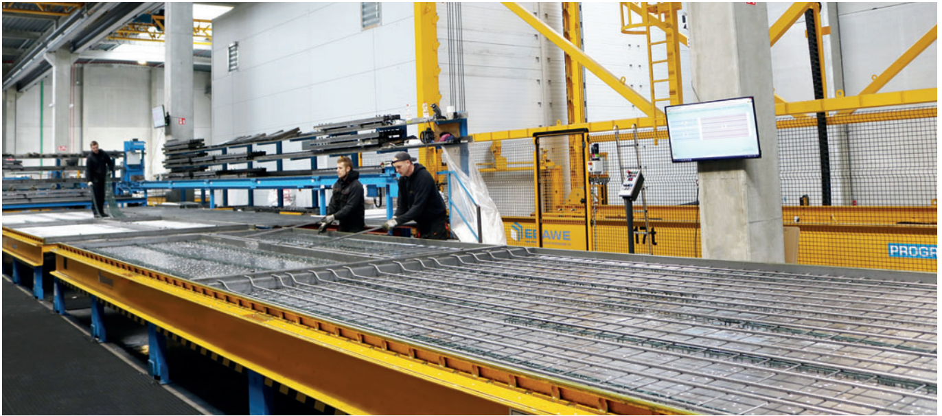
The number of workers, both in Predalco's old and new carousel system, with only 8 individuals per plant is very efficient.

idea of the market, what the others were doing and also the ideal required machinery, when we set out for this adventure. We started touring Europe and visited numerous precast factories to educate ourselves. I was concerned to make basic mistakes due to my lack of knowledge and information at that time, which might lead to a disastrous end of our plans, in particular since we had invested our own money. Initially we had envisaged a daily production capacity of 600 sqm of half slabs for the first 4-5 years. However, soon after the investment into our first carousel plant, we had to find out that the market was very challenging, especially since customers are very tied to their suppliers and the established producers did all to put a lot of pressure on us."