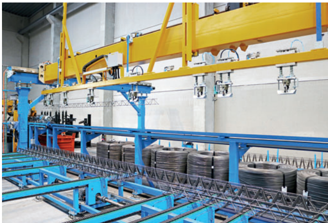
The Progress lattice girder welding and handling machines of the VGA Versa series represent the best in flexible, just-in-time lattice girder production.