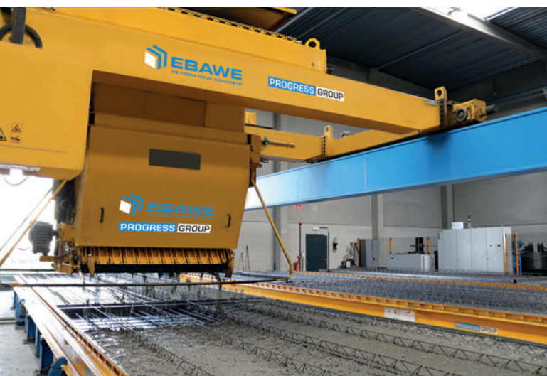
The automatic concrete spreader ensures an even and optimized distribution of the concrete into the moulds.

Also in the new carousel plant, Predalco aims at finding the right mix between manual labor and automation. To guarantee the highest possible degree of precision of its precast elements, the company uses a plotter in its carousel systems to avoid any possible mistakes caused by human error. To save concrete and distribute the concrete in the most efficient and time-saving way, an automated concrete spreader fed by a concreted delivery system, ensures an optimized distribution of the concrete. Because of a very good balance between human labor and automation, each carousel plant is run by only 8 workers, and the company's total production is operated by a total of 16 production workers.