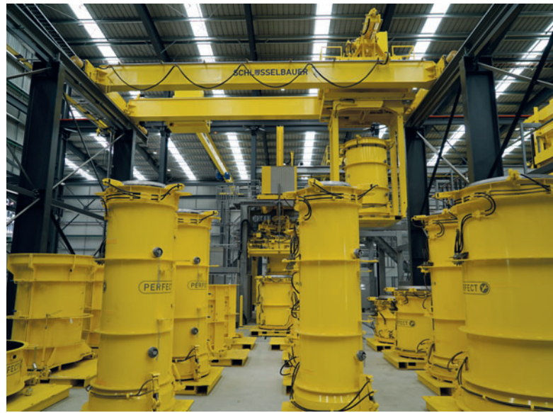
SCC manufacturing, which is one of the world-leading in terms of flexibility and capacity, will be put into service in New Zealand.

optimize. By investing in a new manufacturing site fitted with Perfect Forming Technology, the New Zealand manufacturer Hynds Pipe Systems, is setting the course for the company's continuous development as an entrepreneur and quality leader in the market.