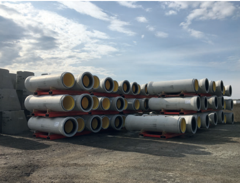
The Perfect Pipe concrete waste-water pipes with a HDPE liner are widely used in Asia, Europe and North America.