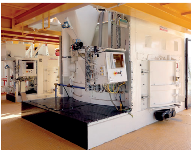
SM3375 / SM400 Mixing plant

The RH 2000-3 is a high end production machine which combines many years of machine building experience with the latest proven M-Version technology, from the most exact dimensional tolerances to the strongest durability in concrete den-