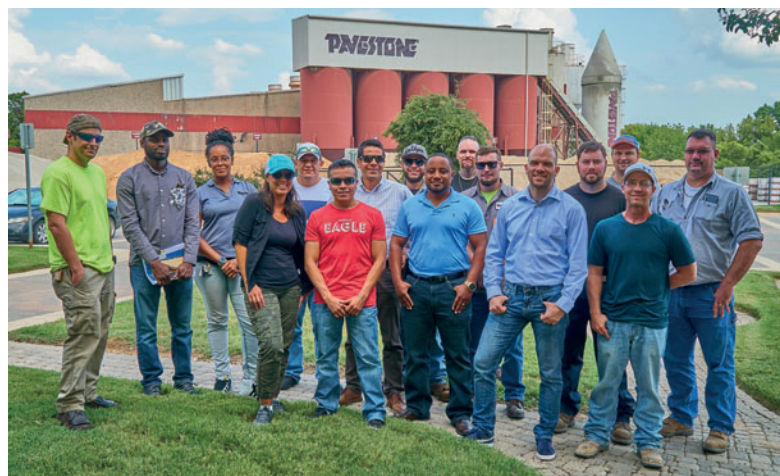
Satisfied faces after an intensive and effective Masa training session