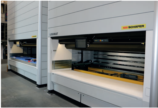
Masa invests in efficient intralogistics: processes can be significantly simplified by means of warehouse lifts.

At the beginning of each training course, the participants receive detailed training materials that can be used as an accompaniment. Participants will be trained on software developed by Masa, making the learning experience as relatable as possible. The production process within a plant is visualized step by step with animated pictures.