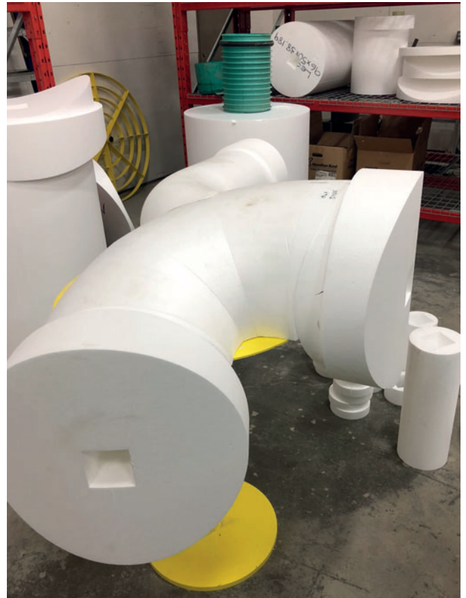
The position and incline of the pipe connections and the height and junction of the main channel are freely selectable.

imposes substantial regulations in terms of pipe grades, manhole composition and ideal hydraulic design within manholes. It is not unusual to find two, three or more inlet junctions within one wastewater manhole, each with differing elevations, pipe grades and inlet locations. Within a very short amount of time, employees at Leko Precast were able to plan even the most complex of manhole geometries indepen-