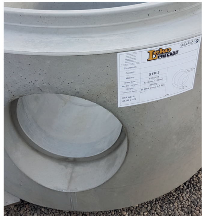
An adhesive label is affixed to each component which contains all the necessary data relating to the product and its installation.

imposes substantial regulations in terms of pipe grades, manhole composition and ideal hydraulic design within manholes. It is not unusual to find two, three or more inlet junctions within one wastewater manhole, each with differing elevations, pipe grades and inlet locations. Within a very short amount of time, employees at Leko Precast were able to plan even the most complex of manhole geometries indepen-