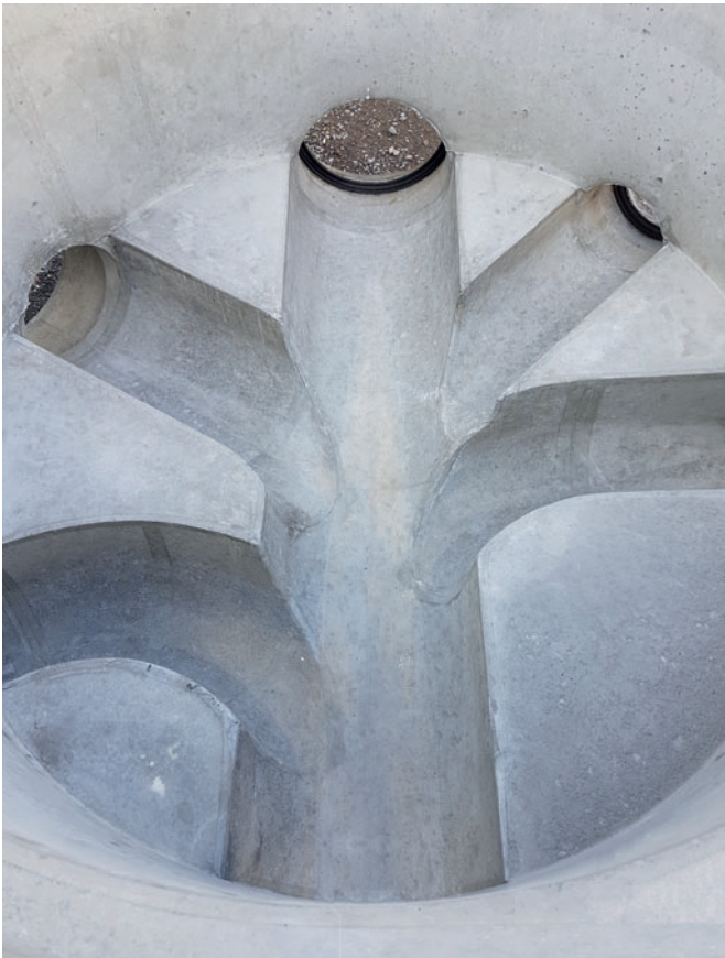
Even complex components with a monolithic construction can be ready for delivery within a single day.