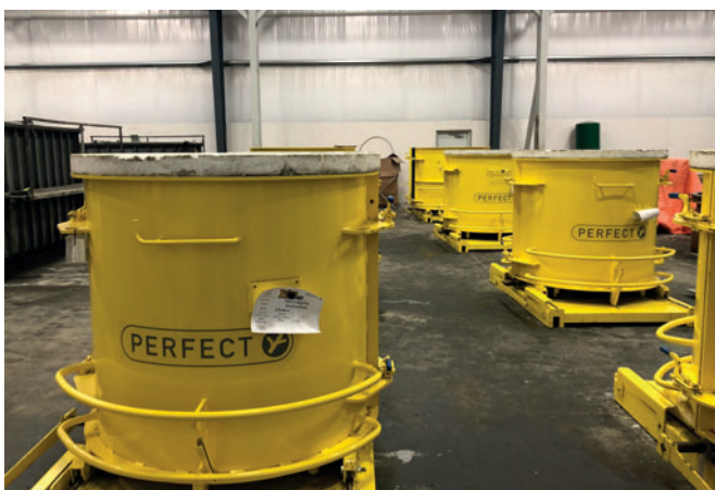
Perfect casting moulds for mould-hardened products are a user-friendly solution for all the necessary work steps, ranging from set-up and filling through to demoulding and cleaning.