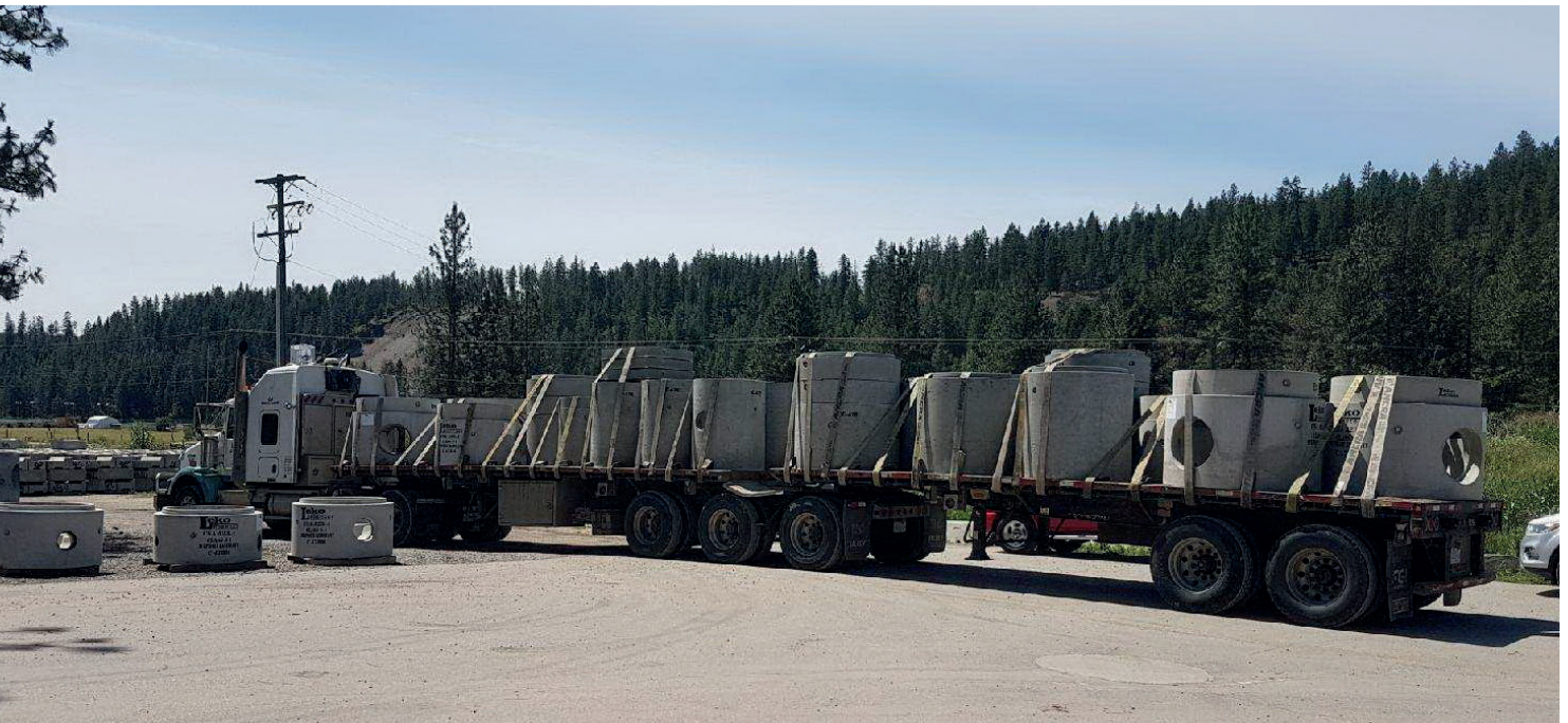
Project-specific picking and delivery of all components, from manhole bases through to superstructures.

dently. The program-controlled hot wire saws cut the EPS moulded parts to shape and workers then join them into the required channel geometries in just a few steps. In addition to the highly economic use of EPS moulded parts for the channels, the use of moulded parts to produce pipe connections is also taken into account at the planning stage, ensuring that complete channel negatives can be used in the Perfect moulds. The manholes bases are poured monolithically with self-compacting concrete (SCC). Once they are demoulded and labeled, they are ready for shipment.