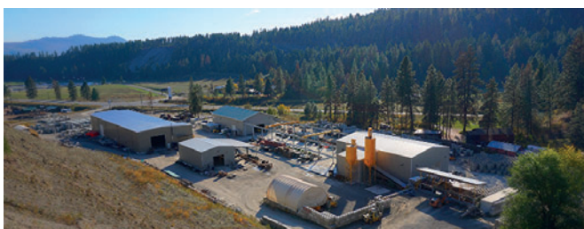
View of the Leko Precast factory in Vernon, British Columbia, Canada

Even though the Perfect system has only been in use for a short period of time at Leko Precast, employees and customers alike have been very impressed with the capabilities of the new system. "Sales of Perfect manholes will contribute significantly to Leko Precast's growth over the next few years. It was relatively easy for us to give the green light to this investment, and it proved to be absolutely the right decision within a matter of weeks. We look forward to a long-lasting and fruitful relationship with Schlüsselbauer Technology as another strong technology partner for Leko." ■