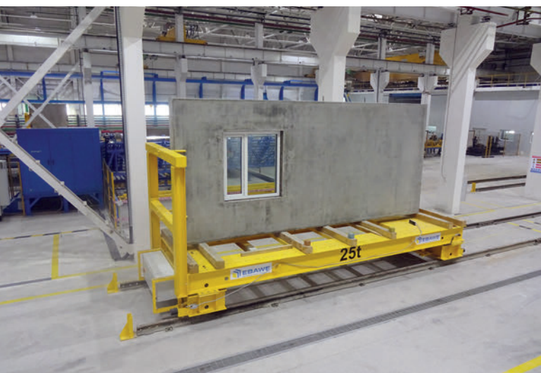
The plant is controlled by the ebos® central control system, developed by Progress Software Development. All work processes are executed via a user-friendly system. A completely new step towards automated work sequences for Mongolia.

With the new "Erel BUK-1" precast plant Erel wishes to be one of the main suppliers of concrete elements for the revitalisa-