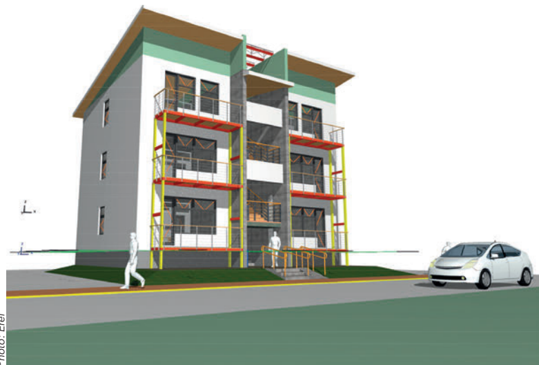
Over 200,000 homes and the associated infrastructure such as schools, hospitals, office space and other facilities are to be erected in an extensive renovation project in Mongolia.