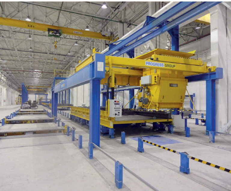
A total of 41 production pallets are available to Erel in the pallet circulation plant from Ebawe Anlagentechnik.