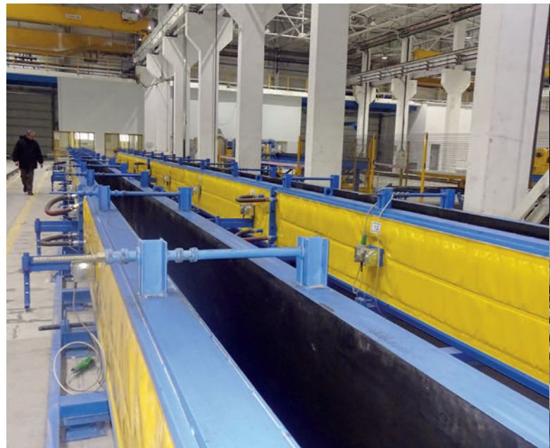
The shuttering specialist Tecnomac supplied both battery moulds and shuttering for the production of columns and beams.

tion project in Ulan Bator and to contribute to the general development of Mongolia. Today it is assumed that over 60% of the population of Ulan Bator reside in informal settlements, so-called "Ger" districts, which are not connected to the city's main infrastructure. This is to change with the extensive renovation project, because the goal is to create 200,000 homes and the associated infrastructure for the urban population, such as schools, hospitals, office space, retail areas, parks and leisure areas, district heating, electricity, water, waste water and other facilities.