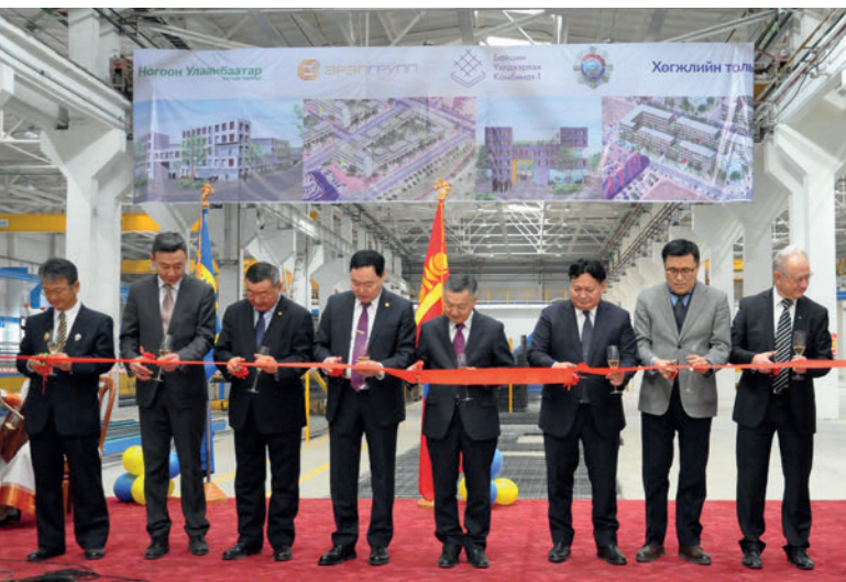
Opening ceremony of the Erel BUK-1 precast plant near Ulan Bator.

The Erel LLC group of companies was founded in 1989 and consists today of more than ten companies from the fields of geology, mining, building materials manufacture, building and road construction, banks and education. The group employs an experienced team of about 1,200 people, who have made it their goal to play a leading part in the development of Mongolia. Comprehensive, integrated and innovative business solutions are offered at all levels in order to achieve this. Numerous subsidiaries have been integrated into the Erel Group over the course of time. Amongst others, Erel owns a wood and PVC factory, a concrete plant, a brickworks, a cement plant, an asphalt plant, a crushing plant, a steel reinforced concrete plant for construction and road construction, a company for property development and the precast plant BUK-1, which was founded in 1963. Around eighty percent of the city of Ulan Bator was erected in the last century with precast concrete elements from this plant. For Erel the takeover of BUK-1 marked an expansion from its original sector of geological exploration and mining. Erel now began to operate in the construction sector and has proven to be a leading