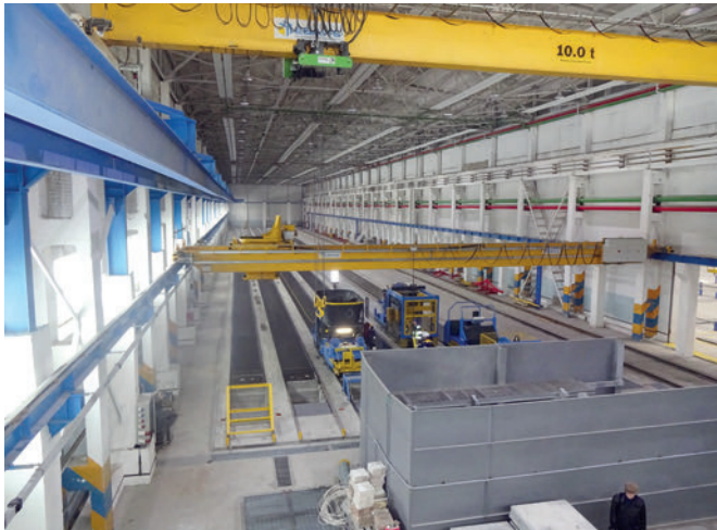
Using the T40 slipformer from Echo Precast Engineering, Erel manufactures prestressed hollow-core slabs in thicknesses from 15 to 40 cm on six production tracks, each 120 m in length.

company in the construction and building materials industry. The extensive plant renovation work then followed in 2014. In 2013 the versatile group of companies had already concluded a contract with the German machine and plant manufacturer Ebawe Anlagentechnik from Eilenburg near Leipzig. Ebawe belongs to the global group of companies Progress Group, with seven subsidiaries in four different countries. The delivery encompassed machines and plants for the manufacture of hollow core slabs, solid walls and ceilings, sandwich walls, interior walls, columns and beams, stairs and the reinforcements required for them.