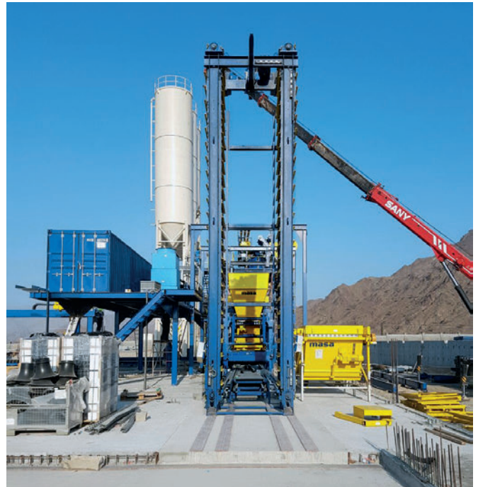
The new concrete block production plant during the assembly: The main components are already in place.