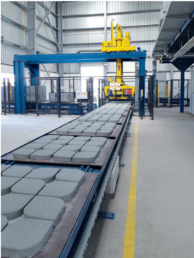
The cured products are transported to the Masa Cuboter by a walking beam conveyor.

After delivery and installation of the reliable Masa standard equipment, Masa took intensive care of training the operating personnel. The training of the customer's personnel included mechanical maintenance, electrical troubleshooting and servicing of the system. The training was organised and carried out by the Masa training team, which has many years of experience in the Masa operation. The 3-week training course included the areas of safety and access to the plant components, setting the plant parameters and efficient operation of the plant.