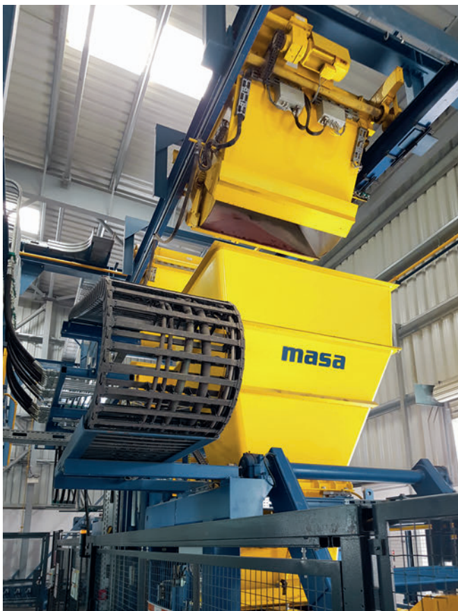
The concrete from the outside concrete mixing plant to concrete block machine Masa XL is transported via a double bucket conveyor system.

There were good reasons to settle here with a company producing concrete blocks. Samail will become Oman's largest industrial area, its population is growing steadily and the area has large deposits of raw materials. Ali Al-Barwani, Managing Director of the Al Madina Cement Group, therefore built a new production facility for high-quality concrete blocks and pavers on an area of 30,000 m 2 . Based on the key values of "safety, respect, interaction", the company Al Madina wants to bring quality products to the market and - especially in the Samail/Oman area - become one of the main players. In order to achieve this goal, Ali Al-Barwani took a close look at the manufacturers of block production plants. The offers of the competitors were on the table, but in particular the solid