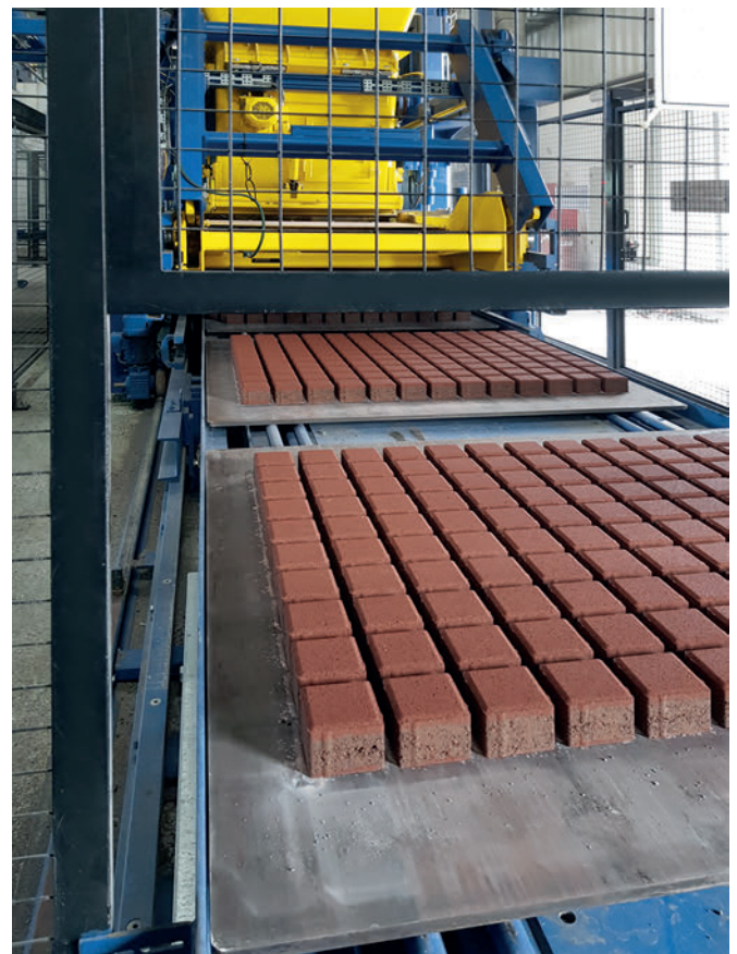
Freshly produced - The production pallet size is 1400 x 1300 mm.