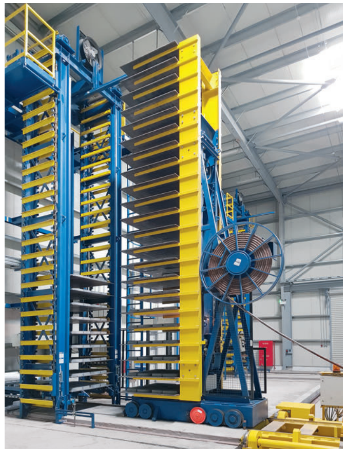
View to the finger car in the curing area.