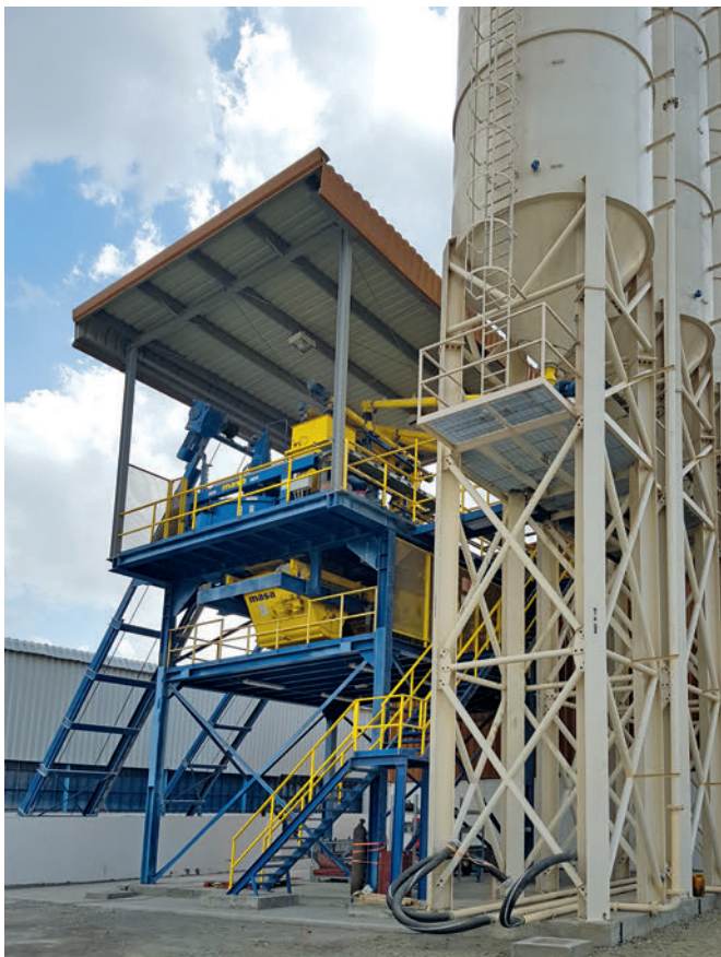
The outdoor mixing plant including the Masa mixers PH 2000/3000 and PH 500/750.