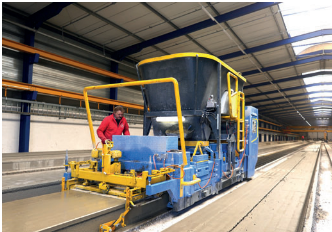
The Echo slip former is the core of the new production system. The S-Liner slip former is the ideal solution for versatile, flexible production requirements.

The automatic plotter from Echo Precast Engineering makes it possible to draw and print data such as cutting angles, project identifications and the area to be detached on precast concrete elements. Both the on top of the hollow core slabs and at the two sides of the precast concrete elements can be printed. The machine has an industrial PC. Data are transferred as a pxml file either via a USB storage medium or via a wireless network connection and controlled by special software prior to printing. Since the automatic plotter is battery-powered, no cables are required for production.