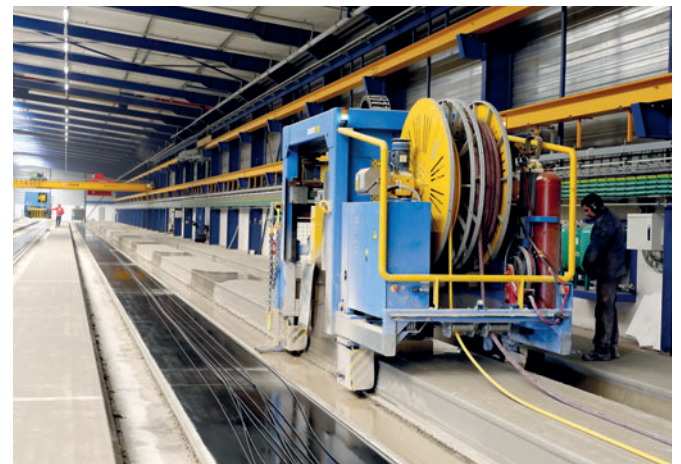
The automated Multi Angle Saw for cutting the Hollow Core slabs at the desired length.