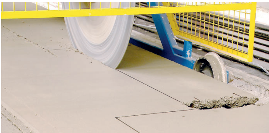
With the fresh concrete saw hollow core slab can be processed directly after the finishing process without any problems.