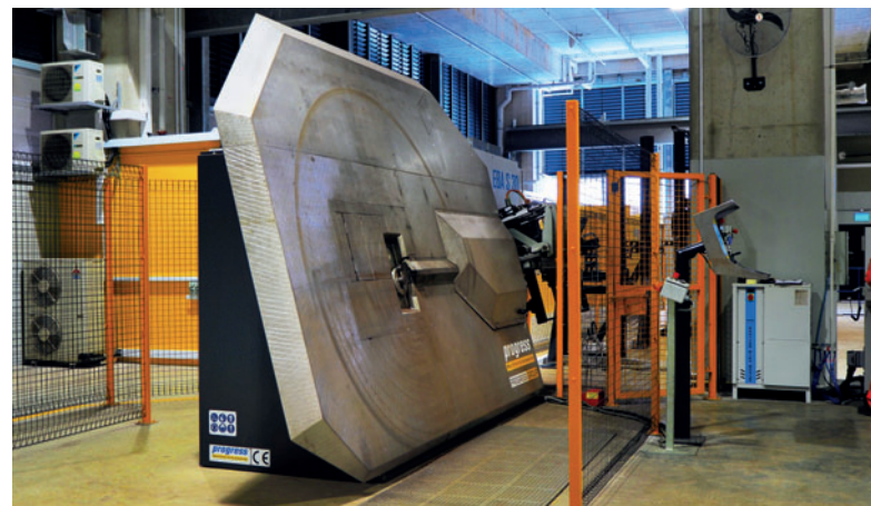
An EBA S16 Plus 3D automatic stirrup bender is used for the manufacture of bars, bars with bending run-off, stirrups, and 3D stirrups.

The second floor has been reserved for stationary production. In addition to the three staircase shutters and in cooperation with the Northern Italian prefabricated bathroom specialists, Bathsystem S.p.A. four 3D shuttering moulds and the associated four production tables for the manufacture of bathrooms and kitchens have been delivered to Greyform. The 2.8 m high shuttering moulds are remarkably flexible, since both the wall shuttering and the floor slab are adjustable. This means