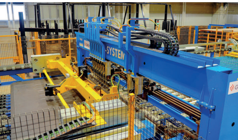
The made to measure mesh required is manufactured on the first floor of the factory building. The M-System Evolution mesh welding plant has been developed to make production as flexible as possible and blends perfectly into the overall concept.

Greyform uses the S-Liner T40 slipformer from Echo Precast Engineering for the production of pre-stressed precast concrete elements. By means of three different slipformer moulds not only is it possible to produce hollow core slabs 7-40 cm in height and 120 cm or 240 cm in width on the 84 cm long production lines; pre-stressed solid slabs 7-20 cm in height and 100 cm or 210 cm in width can also be produced. Additional equipment, such as two different saws, a multi-functional trolley and the associated lifting equipment complete the plant. "The hollow core slabs allow us to cover longer span with single elements - in addition, it is possible to work on the construction site with less columns," explains Ryan Lim.