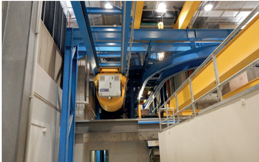
Even the fresh concrete is delivered automatically to the production lines by means of various bucket conveyors.