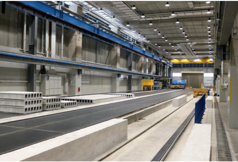
Greyform uses an S-Liner T40 slipformer on three beds for the manufacture of hollow core slab and pre-stressed elements.