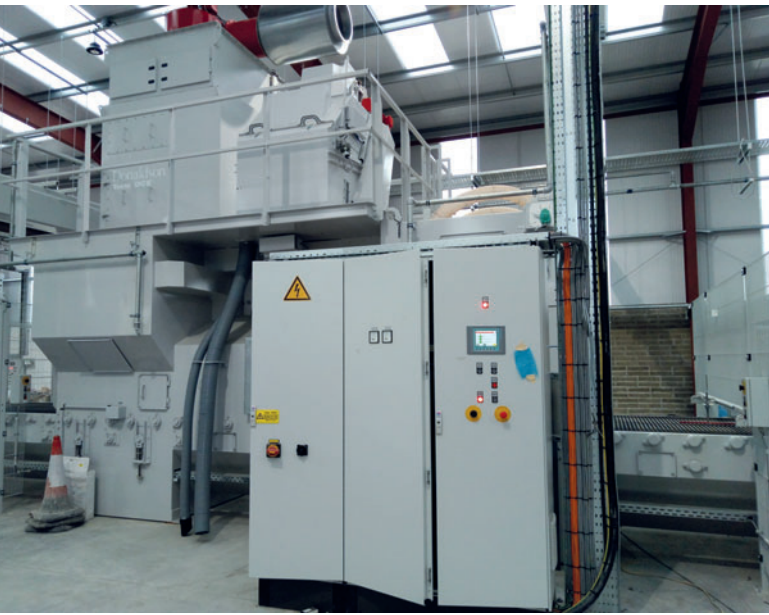
In the shot blasting machine the products are machined in layers spaced at least 600 mm apart with abrasives propelled by two turbines rated at 18.5 KW each