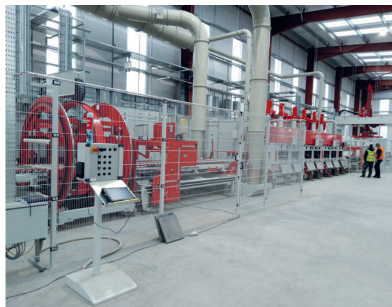
The drum turner turns the products over again by 180° and the workpieces move with the facing side on top into the grinding machine.