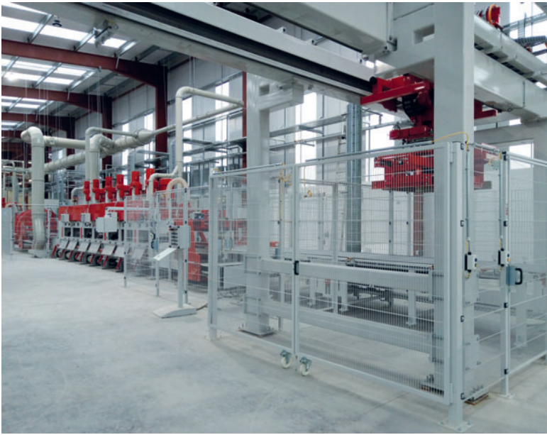
Layer transfer device with electrical 4-sided clamp

ment of the product height is done mechanically, while the fine adjustment is achieved by means of weighted feeler rollers that run on the surface of the product. Height differences between the slabs are compensated by means of parallelogram guidance between the feeler rollers and the miller. A further angular transfer device rotates the products by 90° so that the two remaining edges of the product can be machined in chamfering machine 2 with a working width of 1,000 mm.