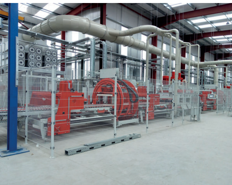
The dust extraction system for the calibration and grinding machine is designed for a flow rate of 40,000 m 3

Products that are to be chamfered are separated by an angular transfer device so that the slabs pass through chamfering machine 1 with a working width of 1,200 mm. Chamfers are applied to the product on the left and right sides with a chamfer milling support. The width of the chamfer can be set by manually adjusting the milling supports. The coarse adjust-