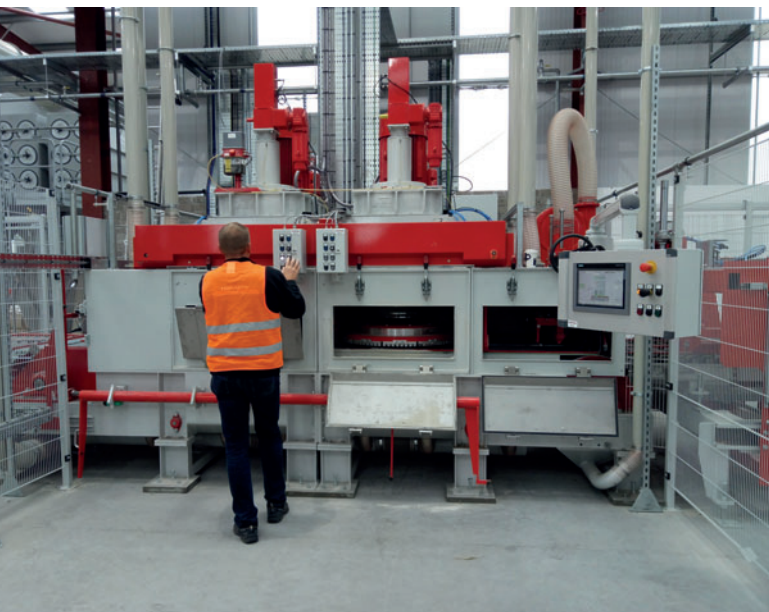
The calibrating machine with two stations operates in dry mode

products are turned by 180° from the facing side onto the base-mix side and subsequently conveyed in an endless line into the calibrating machine. The calibrating machine with two stations operates in dry mode. The calibration takes place with diamond milling segments in dovetail guides that allow fast tool changes. The holding plates for the tools are universal, allowing also the use of both smoothing and grinding segments. The motors for the machining and height adjustment are frequency controlled. The lateral guides in the calibrating machine can be adjusted electrically to the respective product width in inching operation.