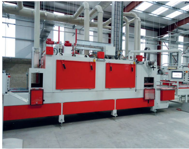
In the curling machine, too, the lateral guides are adjustable electrically to different product widths in inching operation.

The curling machine is equipped with two processing tunnels, each with two brush rollers, and has been configured so that two further brush rollers can be retrofitted. The brushes are suspended with an inclination of about 5°. Brushes 1 and 3 run in the opposite direction to brushes 2 and 4. Due to this counter-rotating processing, line traces of the brushes on the surface are avoided.