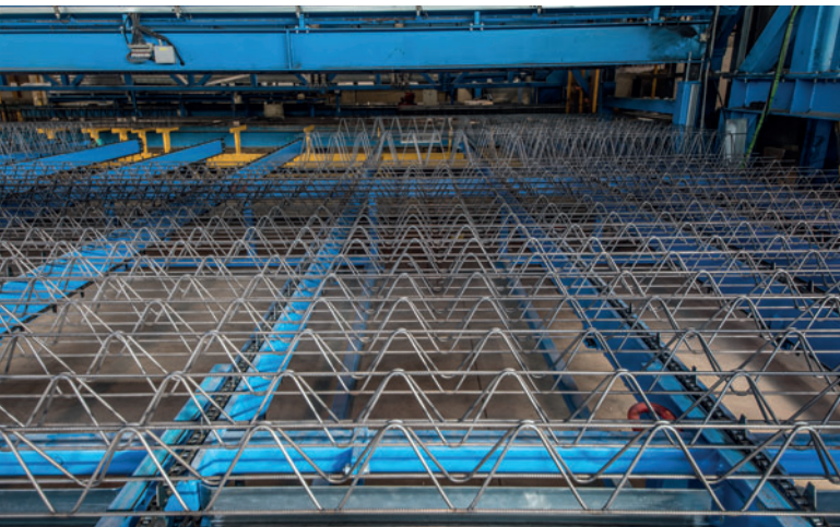
Both the height of the lattice girder and the diameter of the wires can be adjusted infinitely during the production.