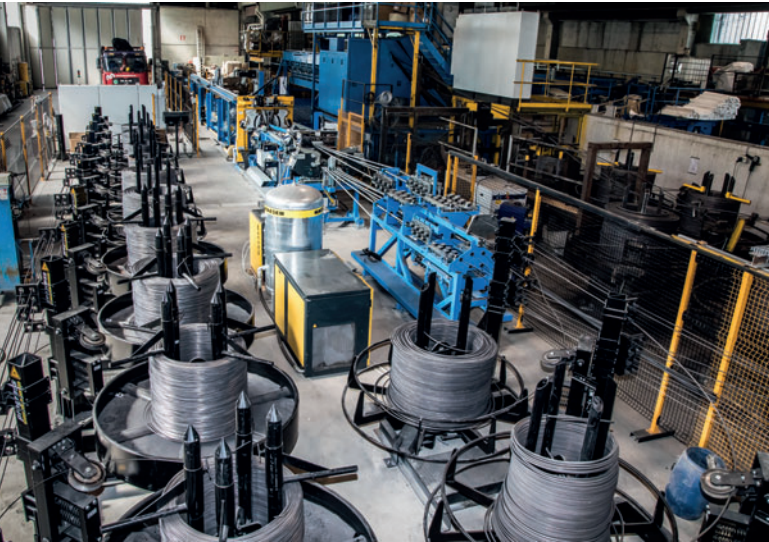
The new VGA Versa manufactures all lattice girders required for the production of double-walls and precast slabs with in-situ topping in-house and up to heights of 650 mm.