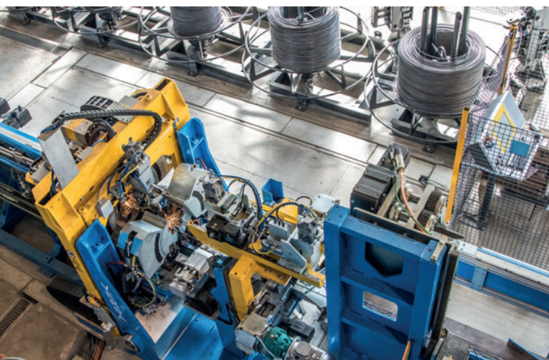
The flexibility of the VGA Versa has enabled the elimination not only of the high costs for the storage of various types of bought-in lattice girders, but also of all waste.